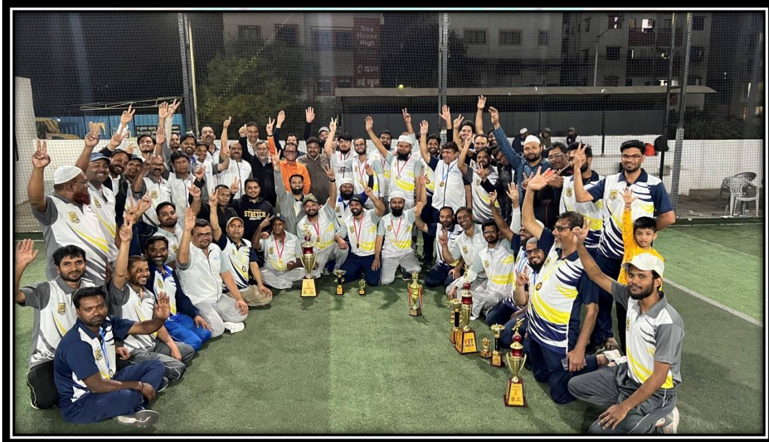
All teams with their Prizes