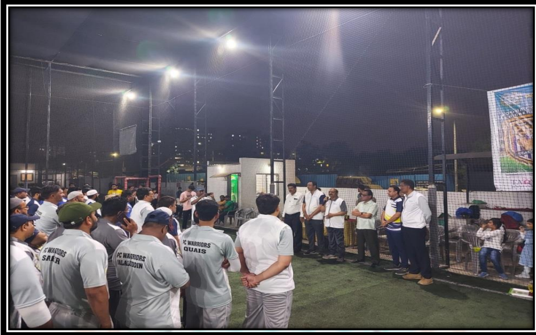
Inaugural Function: PCCL Season 3

(AFFILIATED TO SAVITRIBAI PHULE PUNE UNIVERSITY)