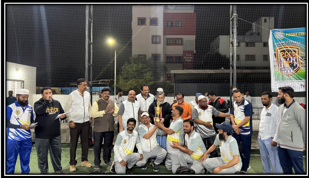
Winning Team of PCCL Season 3

(AFFILIATED TO SAVITRIBAI PHULE PUNE UNIVERSITY)