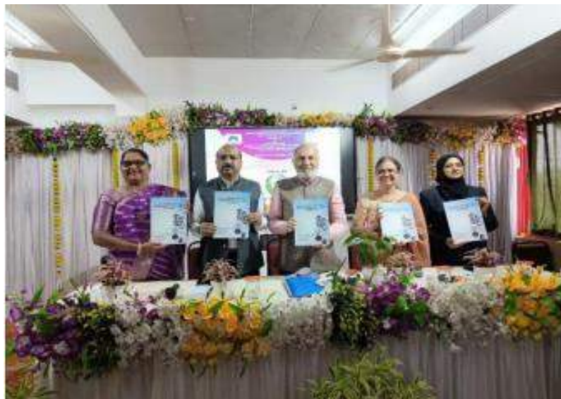
Unveiling Edited Book Journal International Conference, Goa. Date: 29/02/2024