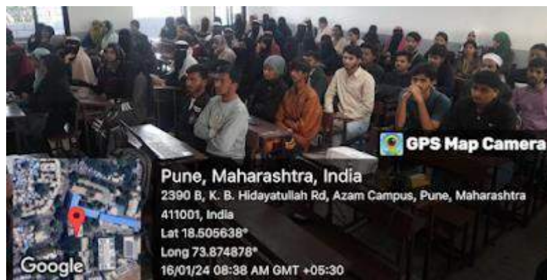
Students of SYBCOM engrossed in attending Online Session (Webinar) on Securities Market by NSDL on 16/01/2024