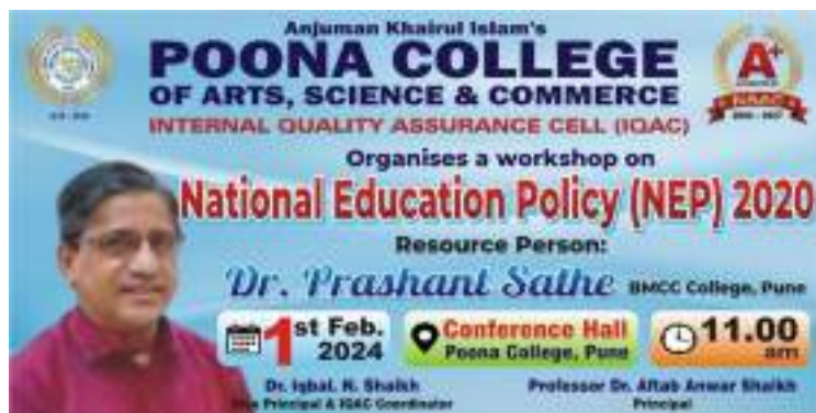
Banner of the Workshop on National Education Policy (NEP)2020

The workshop drew participation from a total of 90 staff members, fostering a conducive environment for collaborative learning and insightful discussions on the transformative potential of NEP 2020.