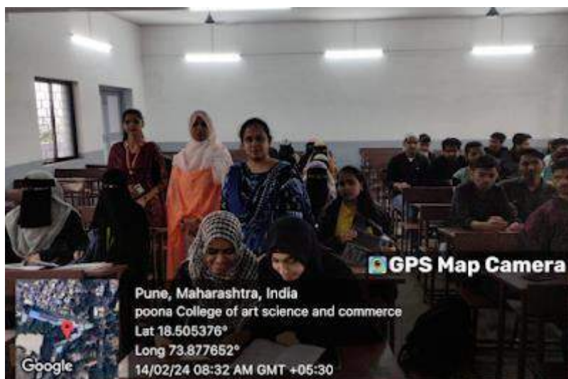
S.Y.B.COM Students attending the Business Management Guest Lecture