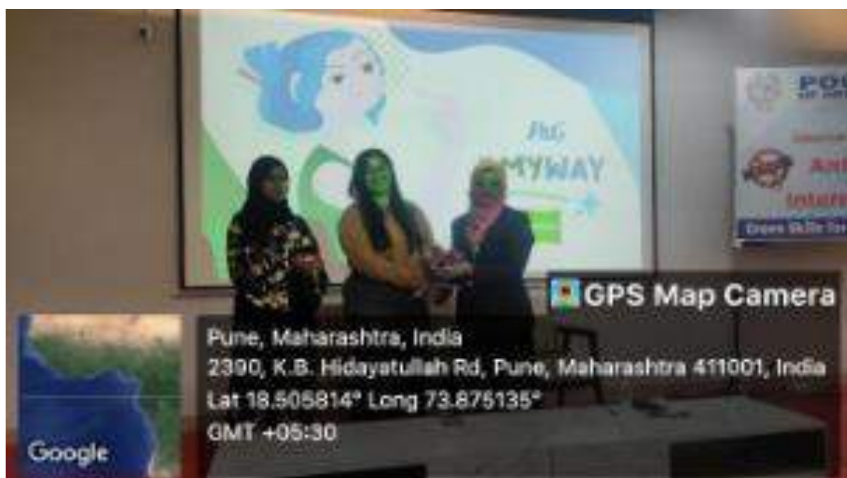
HOD Commerce Felicitating the guest Speaker on 17/08/2023