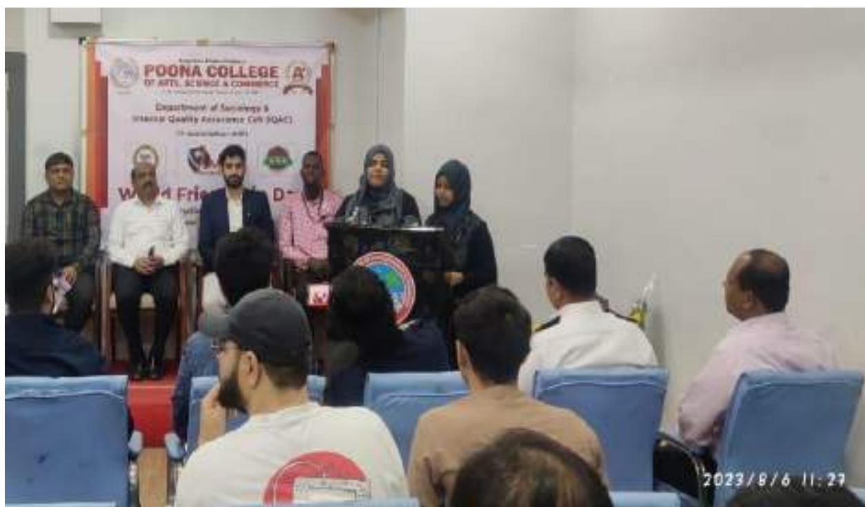
Audience, who actively participated in International Symposium on World Friendship Day