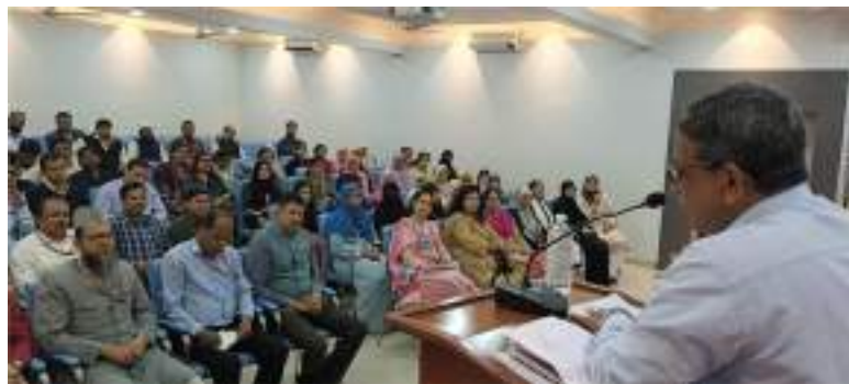
Teaching faculty in rapt attention in the National Education Policy Workshop (NEP 2020)