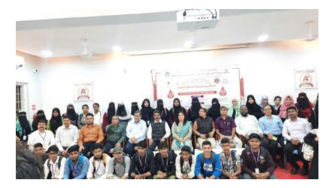
Figure 8. Group Photo with students and IMA Associates.