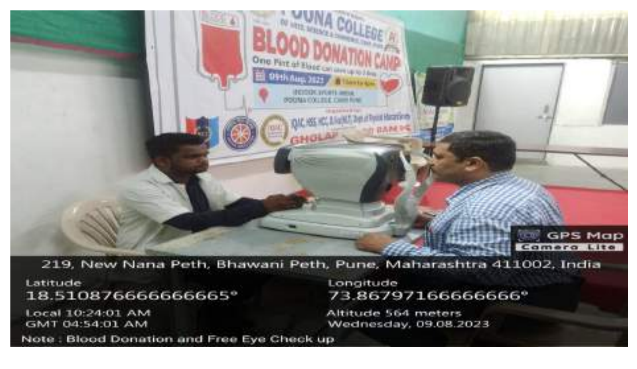
Figure 6. Eye check-Up desk