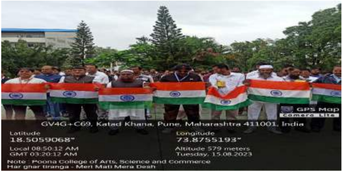
Teaching and Non- teaching staff with the National Flag