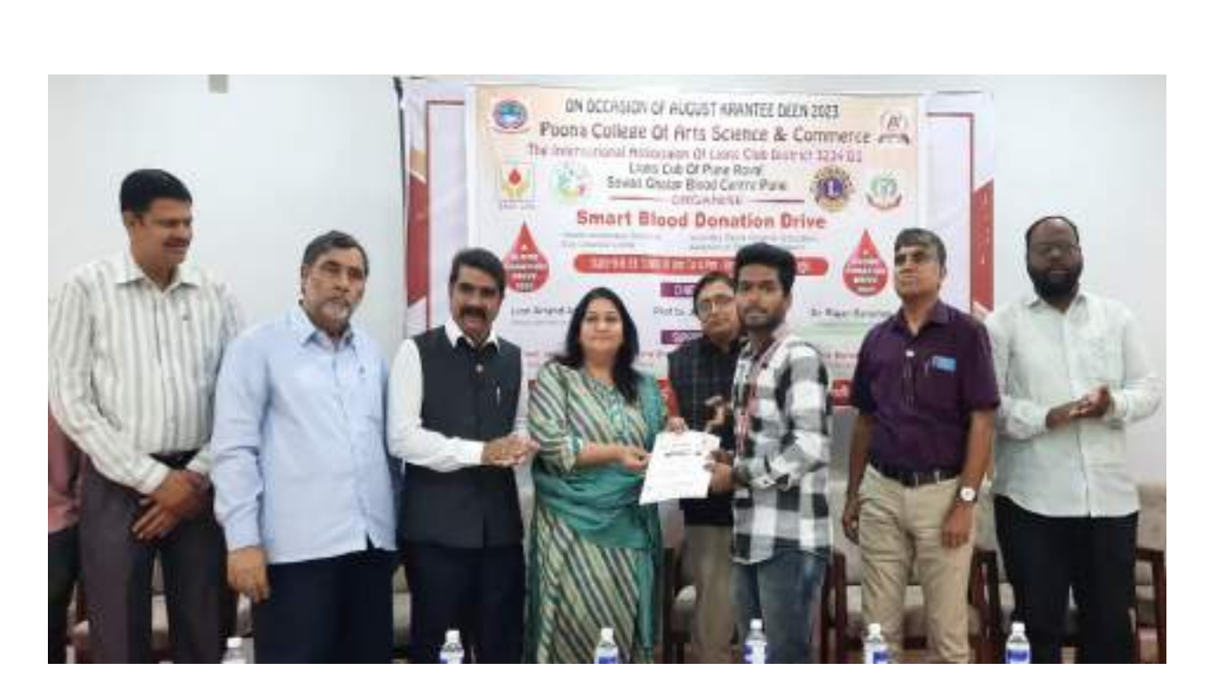
Figure 7. Donor awarded with blood donation certificate .