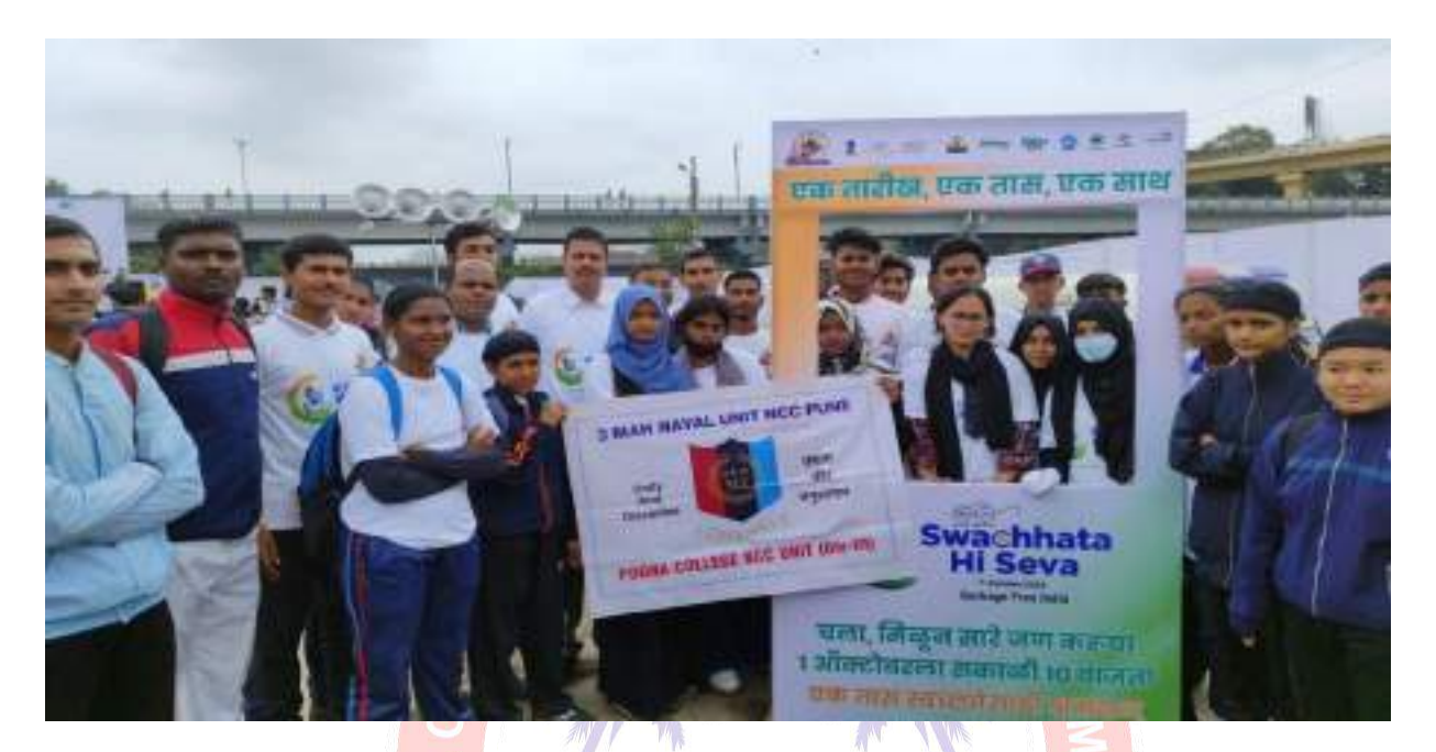
NSS Volunteers and NCC cadets Participated in cleanliness drive