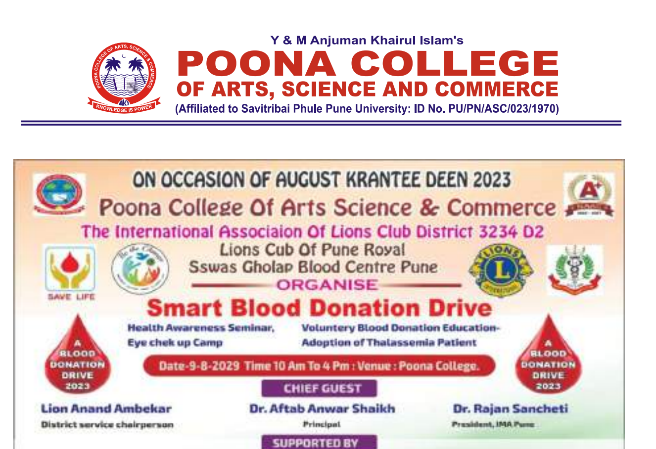
Figure 1. Flex made for the advertisement

रक्तदान ! या सारखे दुसरे कोणते ही निःरचार्थी कृत्य नाही