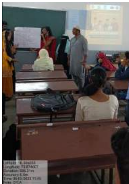
06/03/2023: NSS volunteers during an activity on Gender discrimination.

It was wonderful to listen to students views especially the male students who spoke positively on such a sensitive issue!