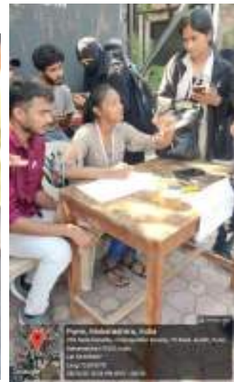
29/12/2022: NSS volunteers guiding students during Voter Registration Drive