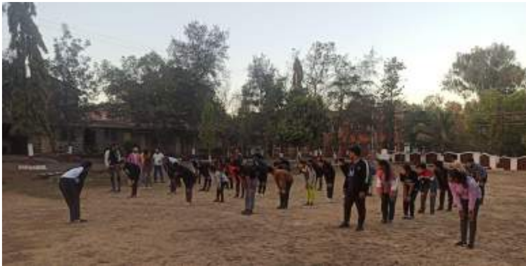
Exercises early in the morning

5. Morning Exercises & daily chores: Health, fitness and discipline find a place in the regular regime of volunteers in their stay at the Special Camp. Jogging, drill and yoga were practiced on a daily basis at 6am. Group wise division of work was done. Students prepared breakfast, lunch, dinner, cleaned the place of stay, washed utensils as per the work assigned dedicatedly. This helped them gel with each other, learn to adjust and work as a team