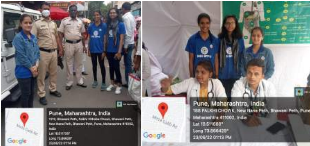
23/06/2022: NSS Volunteers helping police and the medical team during Wari.

Some NSS volunteers assisted Doctors in Swasth Wari Programme. They guided the maulis or warkaris with medical checkup, helping the sick to reach the medical centre, buy medicines and assist them back to their place of stay.