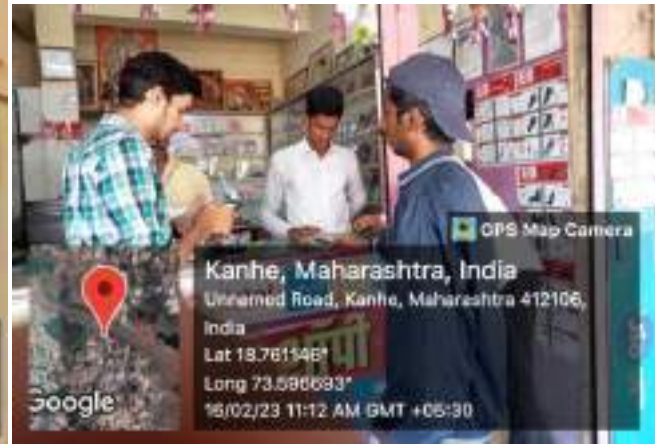
Survey of village (Volunteers speaking to residents, shopkeepers, etc.)