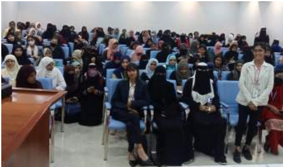
20/10/2022: Students interacting with the speaker.