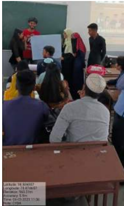
06/03/2023: Student groups preparing and presenting their points of discussion on social issues.

It was wonderful to listen to students views especially the male students who spoke positively on such a sensitive issue!