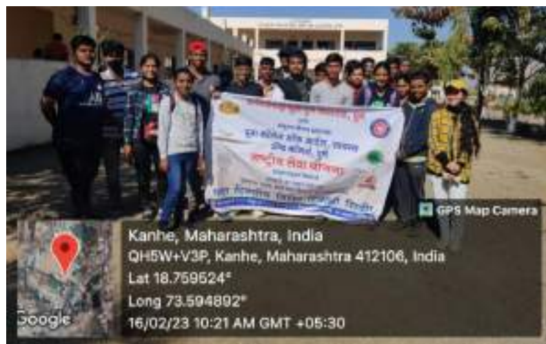
Visit to School