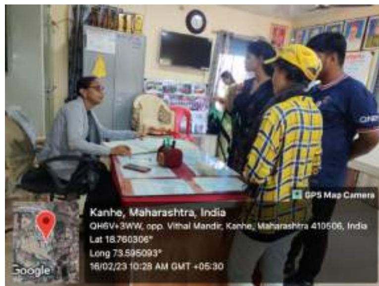
School authorities providing information to NSS volunteers