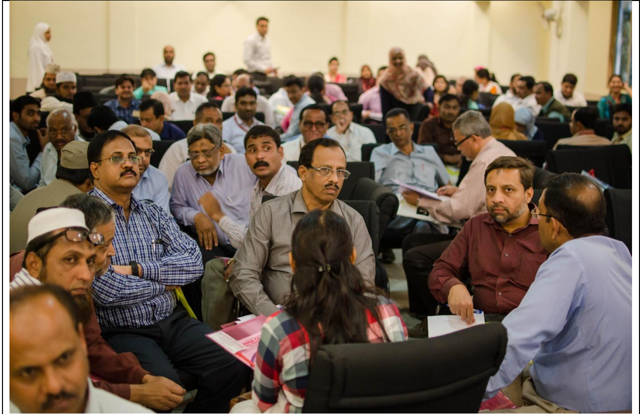
Poona College faculty members: Group Discussion