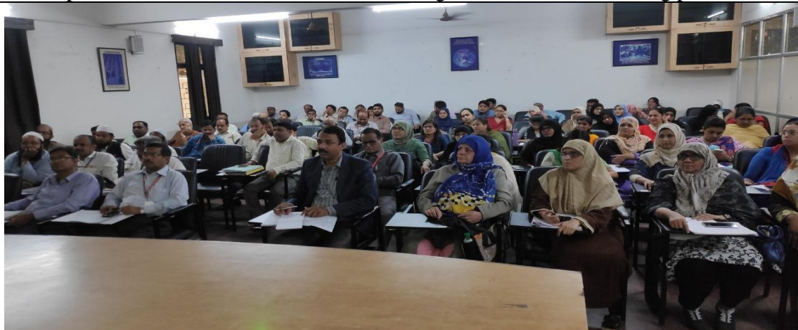
Senior College Teaching Staff Member attending Criteria In charge Presentation..