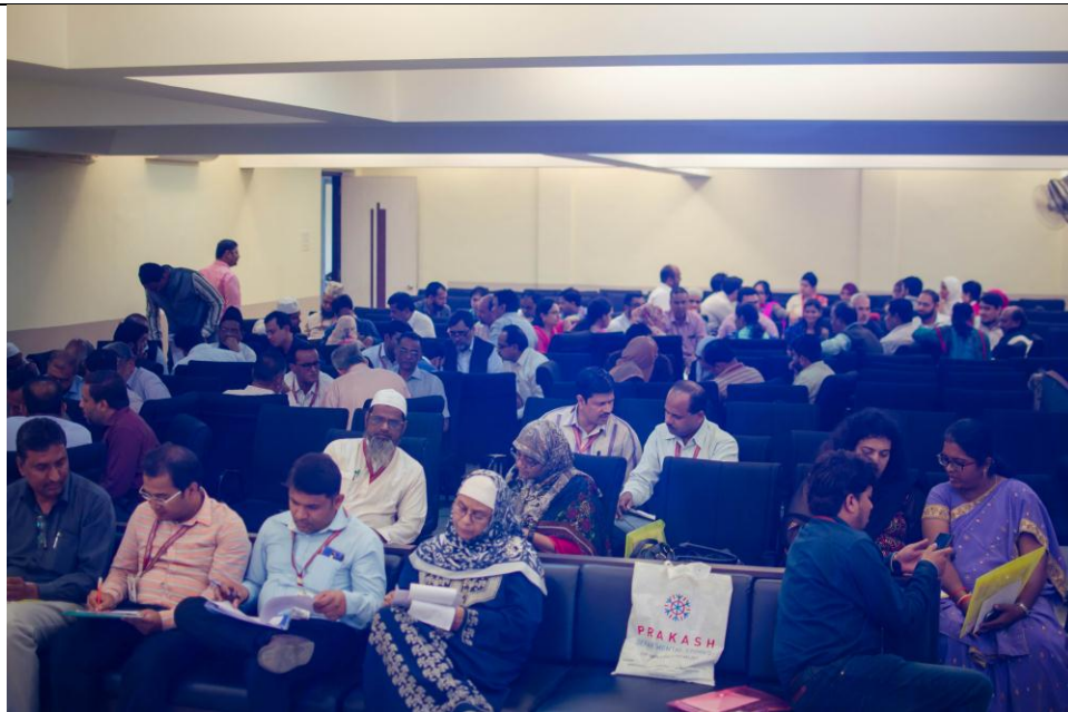
Teachers group discussion during break