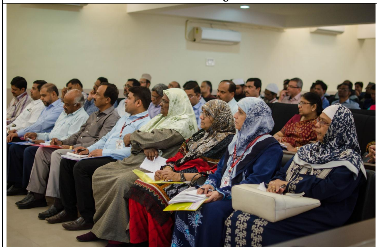
Poona College faculty members attending the Workshop