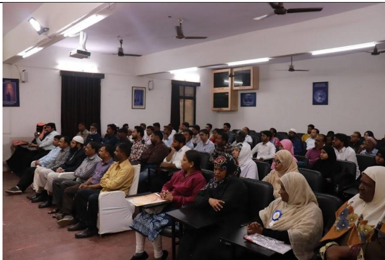
Non-teaching staff attending the workshop