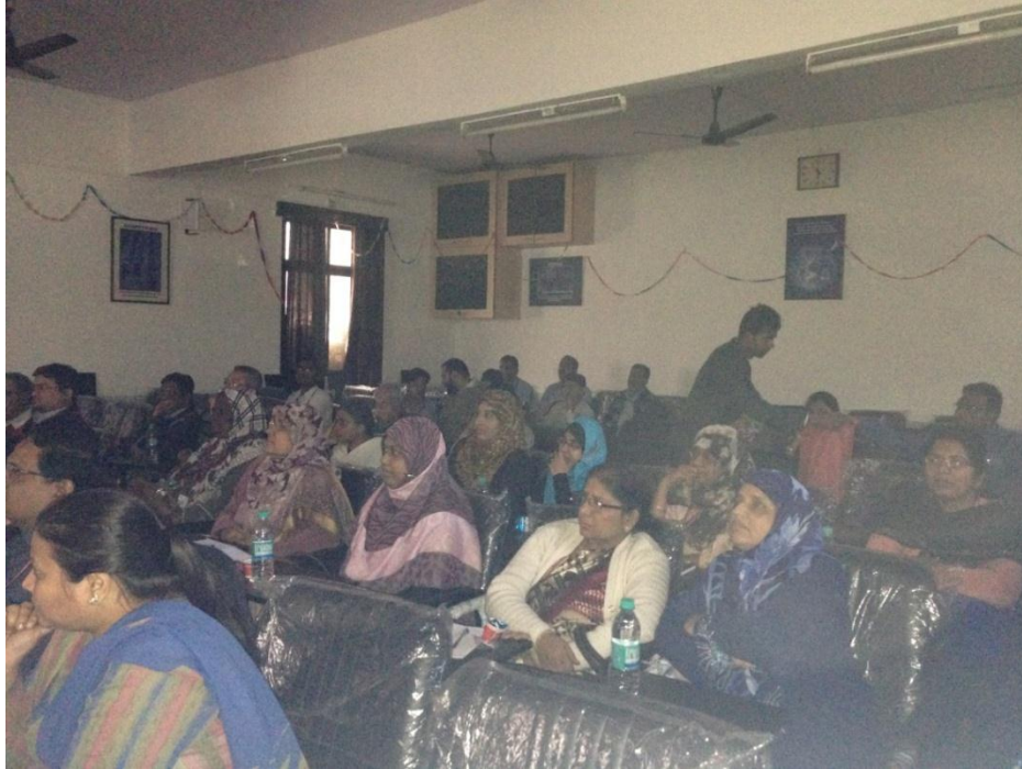
A section of teacher audience during the workshop on E- Content Developing