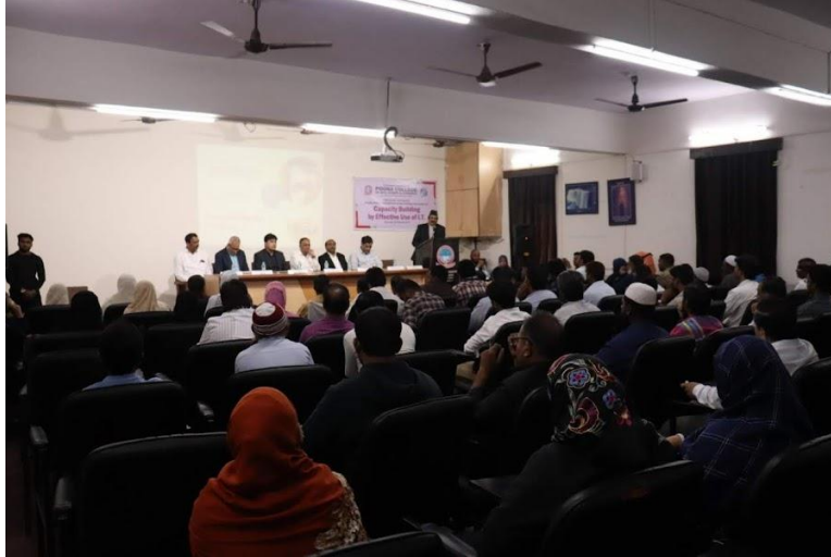
Non-teaching staff gathering during the workshop