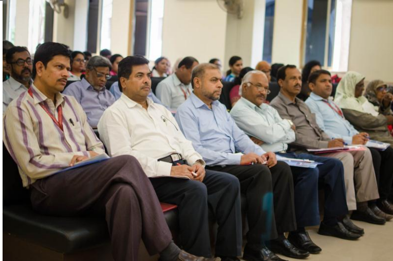
Audience attending the workshop