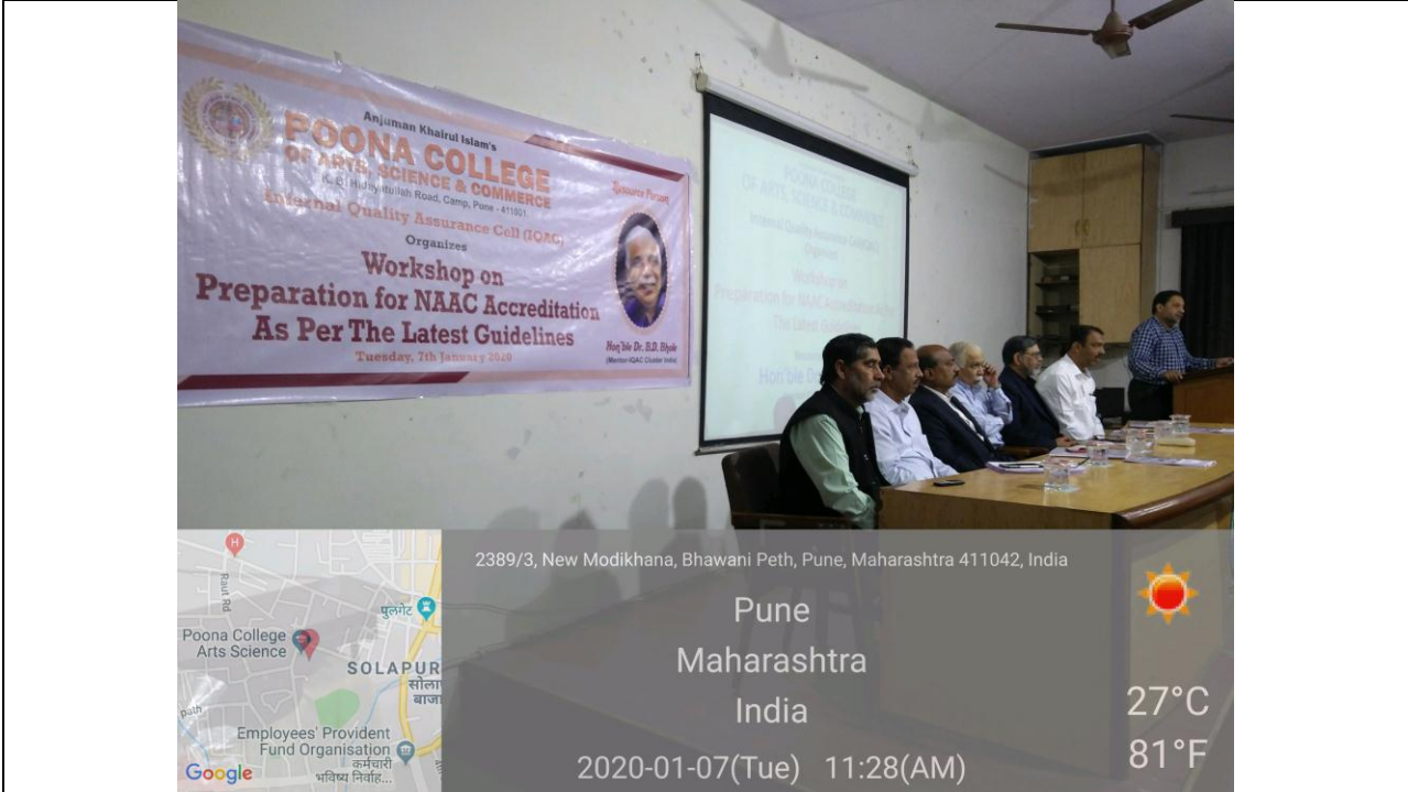
Beginning of the Workshop: Dignitaries sitting on the dies