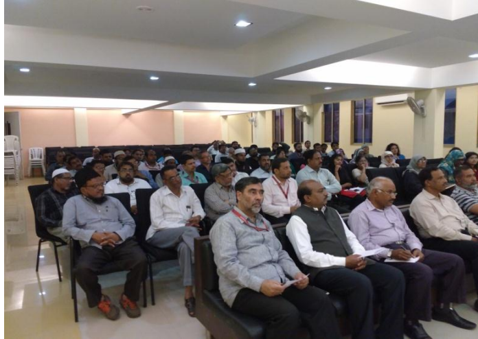
Staff members attending the seminar