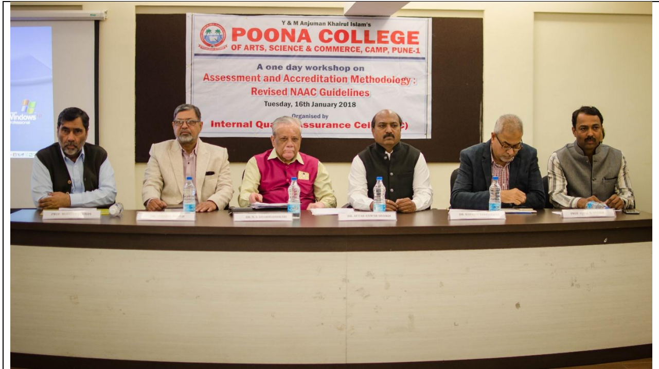
Dignitaries on the dais