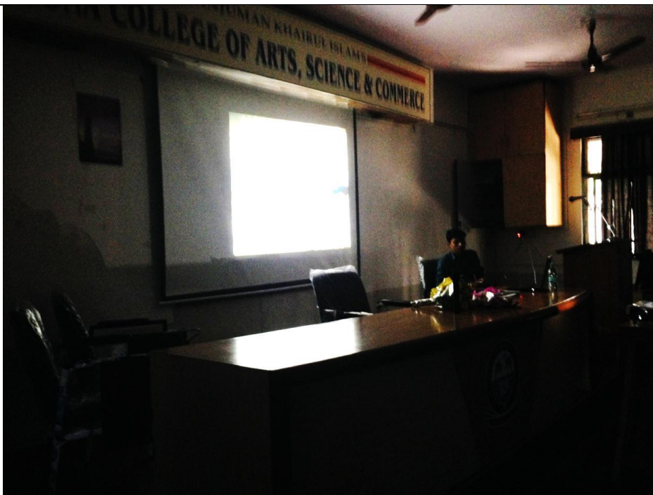
Sample E- Content screened for the teachers in the workshop on E- Content Developing