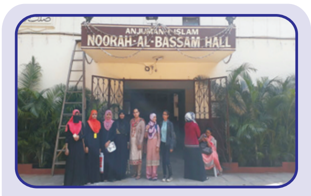
Students along with Co-coordinator at Mehndi Competition, Anjuman Islam Polytechnic.