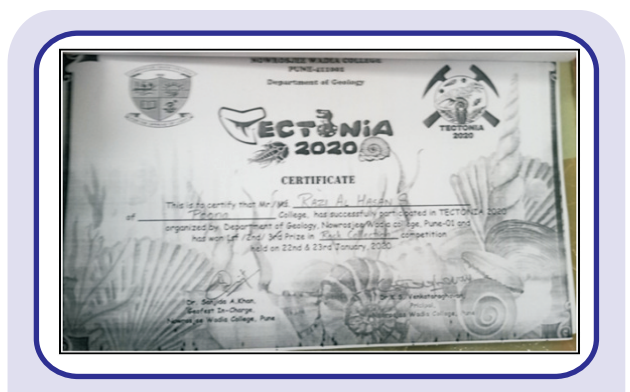
T.Y.B.Sc Geology students, Participated and secured Second Rank