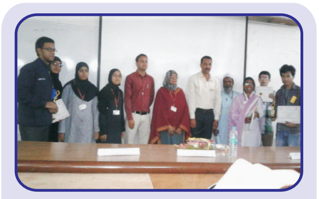
Winners of Quiz, Puzzle and Seminar with staff members