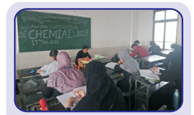
Student participated in "CHEMIAD" Competition

In co-ordination with Association of Chemistry Teachers (ACT), Mumbai,AKI's Poona College of Art's Science & Commerce has witnessed participation at the National Level Chemistry Aptitude Test, Concept Test in Chemistry (CONTECH 2018-19) to assess the conceptual understanding in chemistry on 02/02/2019.