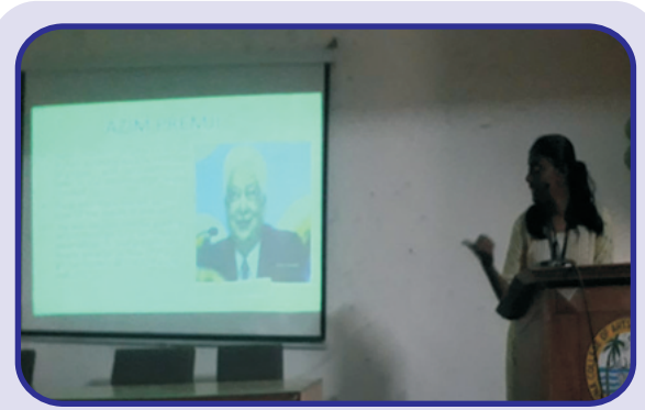
Participant from Abeda Inamdar College, presenting her topic during Story Telling Competition

A Story Telling Competition was organized by Dept. of Chemistry, Poona College on January 28, 2019. This Competition based on success stories of Entrepreneurs. Students from various departments of Poona College participated in this competition and presented the life history of the Entrepreneurs they have selected. They were asked to discuss about the early life, education, ups and downs in their field and the most important is the lesson or take away for us. Participant from UG level discussed the topics very well. The students got motivated to work hard in every aspect of life and they came to know the importance of perseverance after listening the stories of Entrepreneurs & their failures followed by a huge success.