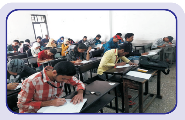
Student Participants of the Inter Collegiate Quiz Competition