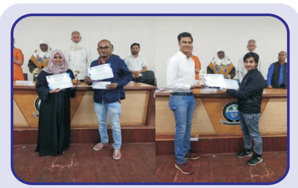
Winners of Quiz Competition

A Presentation Competition was organized by Department of Economics. This competition was designed for the students of Undergraduate students on 04th Sept. 2019. A total of 41 students have attended the competition out of which 30 students has presented. Presentation was mainly focused on poverty, agriculture Status, Age Composition, Economic Policy and their effect etc.