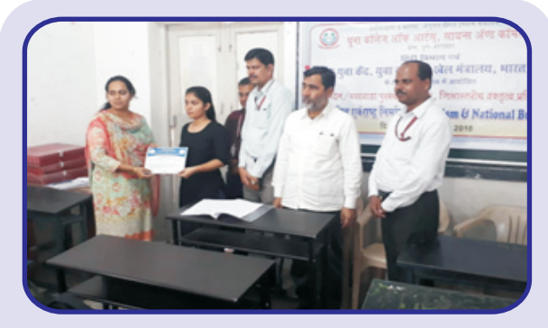
Certificate Distribution in District Level Elocution Competition