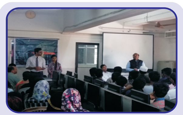
Student and teacher Participants in Poster Competion in "BOTANICA-20" held at Wadia College, Pune

The Departmental activity UNISON was held on 22ndJanuary, 2018 at an intercollegiate level. The students from F.Y.B.Sc., S.Y.B.Sc., T.Y.B.Sc., and M.Sc. (Computer Science) participated enthusiastically in all the competitions.