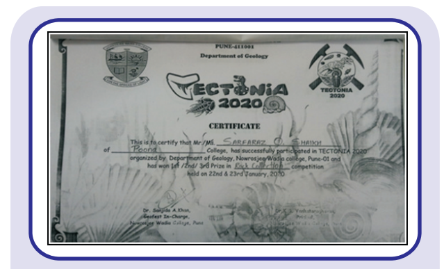
T.Y.B.Sc Geology students, Participated and secured Second Rank

Two T.Y.B.Sc Geology students, Participated and secured Second Rankin Rock collection at TECTONIA, NowrosjeeWadia College, Pune on 22nd and 23rd January 2020.