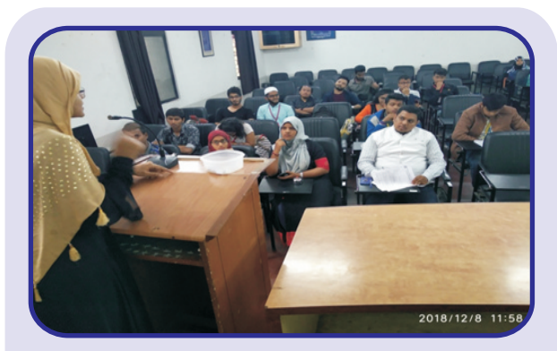
Student presenting her views at elocution competition