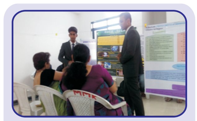
Participated students at Avishkar regional Competition at Sadhu Vaswani Institute of Management