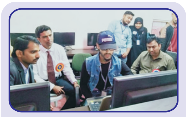
Participants of Software Competition presenting their projects to the judges

The Departmental activity UNISON was held on 22ndJanuary, 2018 at an intercollegiate level. The students from F.Y.B.Sc., S.Y.B.Sc., T.Y.B.Sc., and M.Sc. (Computer Science) participated enthusiastically in all the competitions.