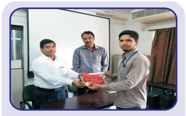
Students receiving the Prizes in the UNISON program