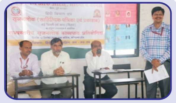
Principal, Vice Principal and Head Dept. of Hindi Certificate Distribution of Srijanlok Kavyapath Pratiyogita