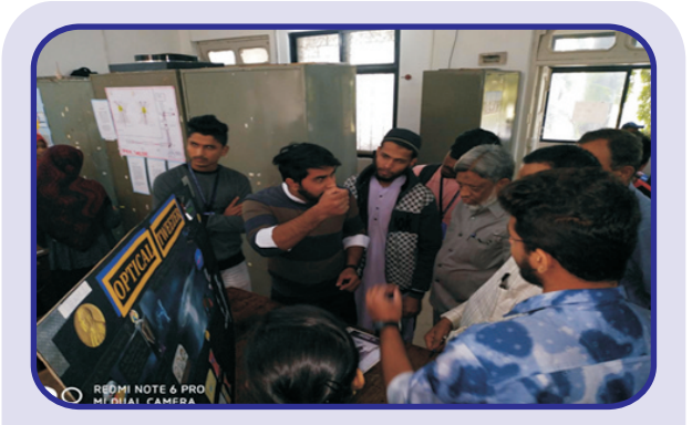
Student is explaining his understanding about the Optical Tweezers