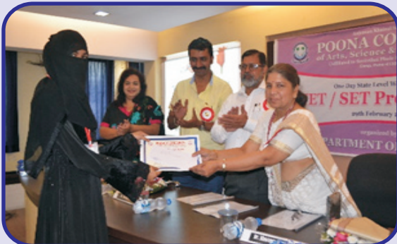
Prize Winners of various competitions organized by our Department