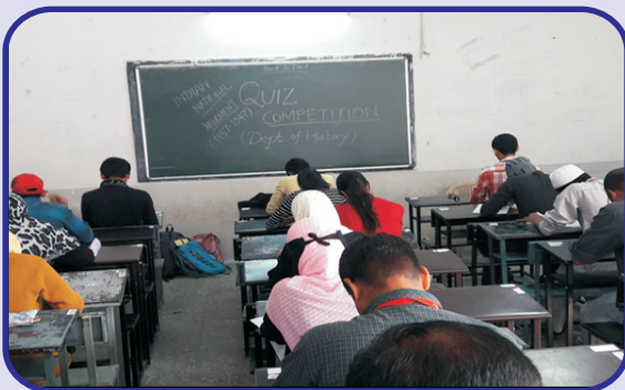
Student Participants of the Inter Collegiate Quiz Competition

The Department has organized Inter Collegiate Quiz Competition on 23/01/2019 (Subhash Chandra Bose's birth Anniversary).