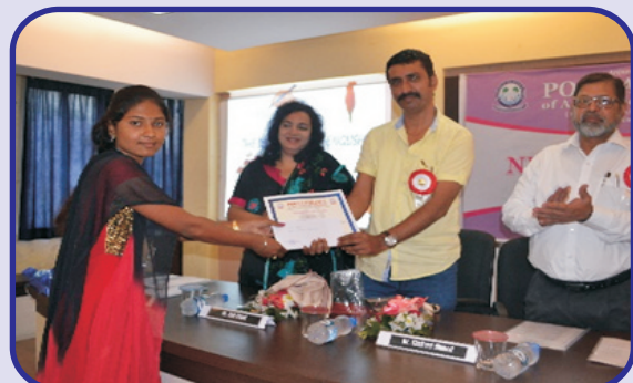
Prize Winners of various competitions organized by our Department