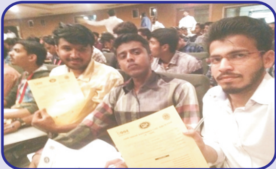
Student participated in "SEED IT IDOL" Competition