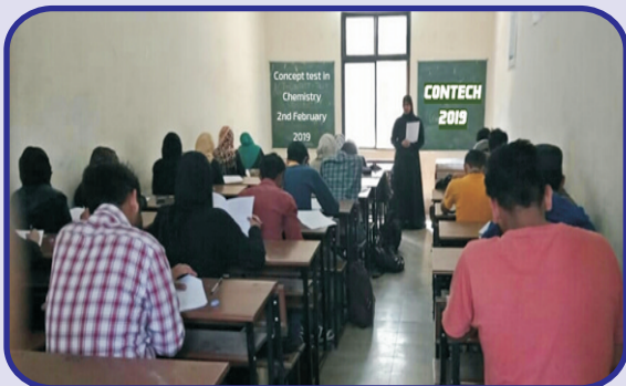
Participated students at Avishkar regional Competition at Sadhu Vaswani Institute of Management