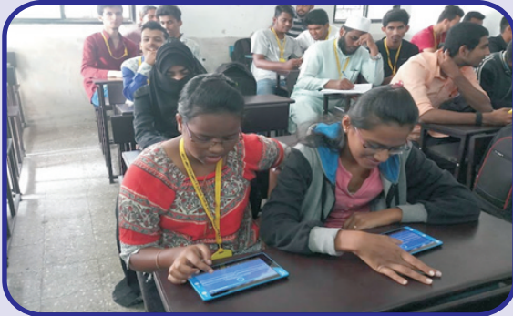
Students of T.Y.B.Com. appearing in the competition

Inter college competition on “Pune Commerce Championship Pune-2018” on 12/09/2018 was held at Poona College, Pune for T.Y.B.COM. (All Divisions).