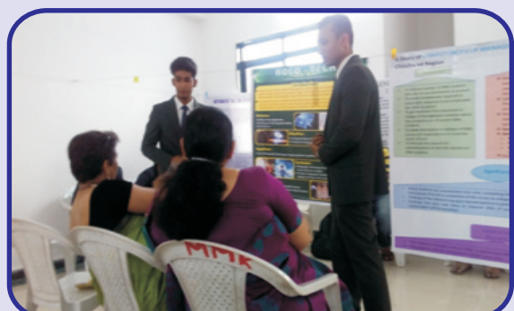
Participated students at Avishkar regional Competition at Sadhu Vaswani Institute of Management