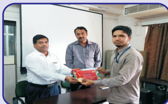
Students receiving the Prizes in the UNISON program