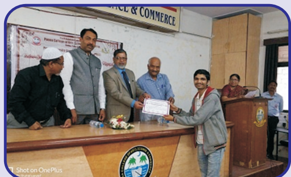
Winners of Quiz Competition