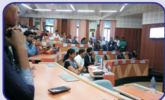
Participants of the 4th International B-Plan Championship