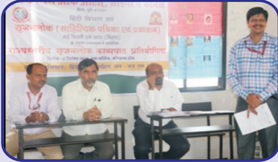
Principal, Vice Principal and Head Dept. of Hindi Certificate Distribution of Srijanlok Kavyapath Pratiyogita