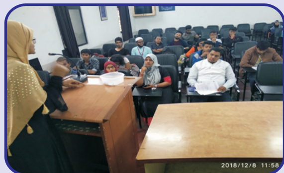
Student presenting her views at elocution competition