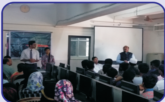
Student and teacher Participants in Poster Competition in "BOTANICA-20" held at Wadia College, Pune

The Departmental activity UNISON was held on 22nd January, 2018 at an intercollegiate level. The students from F.Y.B.Sc., S.Y.B.Sc., T.Y.B.Sc., and M.Sc. (Computer Science) participated enthusiastically in all the competitions.