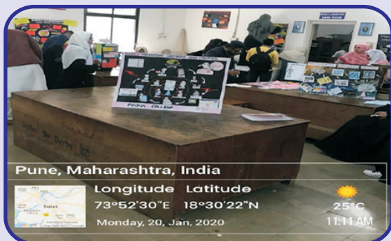
Students are preparing their posters according to their team