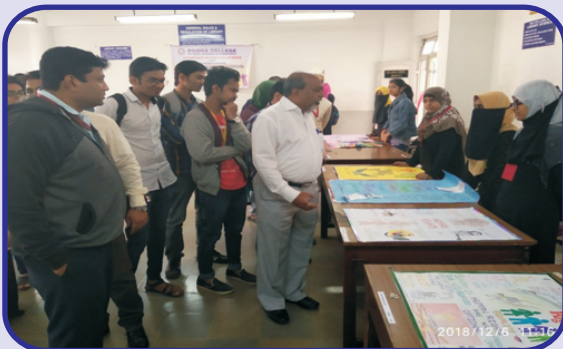
Principal visited to Students demonstrating posters at poster competition