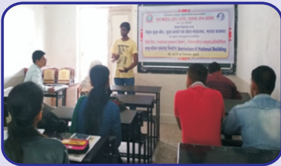
Student express his view in District Level Elocution Competition