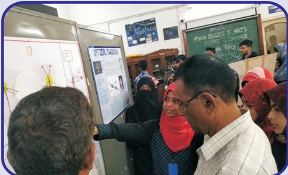
Student is explaining her understanding about the Optical Tweezers to the judges