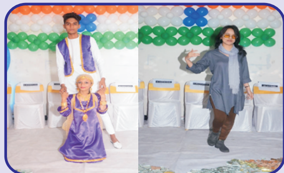
Participants of Colors of India and RJ Hunt Competition