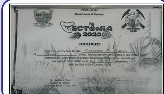
T.Y.B.Sc Geology students, Participated and secured Second Rank

Two T.Y.B.Sc Geology students, Participated and secured Second Rank in Rock collection at TECTONIA, NowrosjeeWadia College, Pune on 22nd and 23rd January 2020.