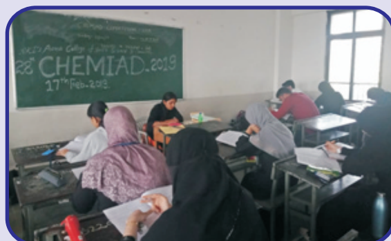
Student participated in "CHEMIAD" Competition

In co-ordination with Association of Chemistry Teachers (ACT), Mumbai, AKI's Poona College of Art's Science & Commerce has witnessed participation at the National Level Chemistry Aptitude Test, Concept Test in Chemistry (CONTECH 2018-19) to assess the conceptual understanding in chemistry on 02/02/2019.