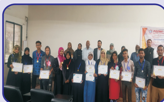
Winners with jury members and faculty members of mathematics department