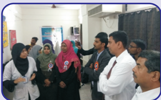
Student and teacher Participants in Poster Competition in "BOTANICA-20" held at Wadia College, Pune