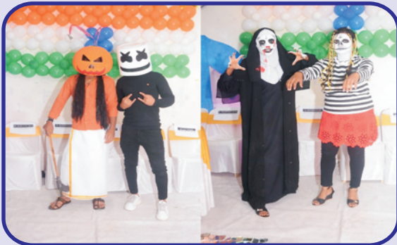
Participants of Cosplay Competition