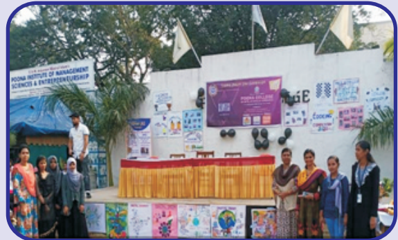
Students, Judges Along With Participants at the Open Auditorim