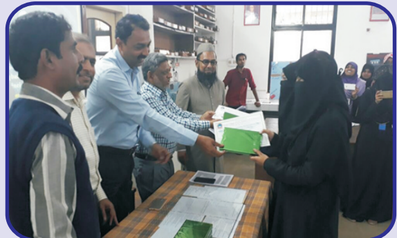
Vice Principal is distributing the certificates and prizes to the winners