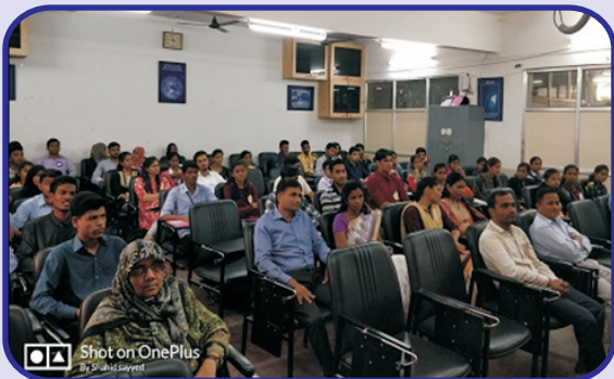
Audience for Quiz Competition

Department of Statistics organised "Inter-collegiate Quiz for S.Y.B.Sc. Statistics Students Final Round" on Saturday 17th February 2018. The activity was sponsored by "Students' Development Board, Savitribai Phule Pune University". This activity was jointly organized by AKI's Poona College of Arts, Science and Commerce, Camp, Pune and Pune University Statistics Association (PUSA).