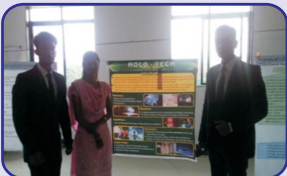
Participated students at Avishkar regional Competition at Sadhu Vaswani Institute of Management