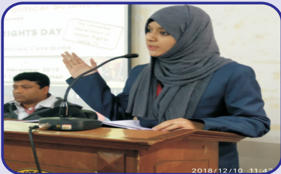
Student presenting her views at elocution competition