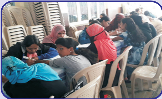
Students showcased their talent in Mehndi Competition

An Intercollegiate Competition was organized by Anjuman Islam Polytechnic for Girls, Bund garden, Pune. Students of our college participated in the competition with great enthusiasm and zeal. There were about 7 students from various faculties of Arts, Science and Commerce who participated in the various events like Mehendi, Collage, Make-up, Poster Competition