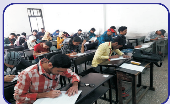
Student Participants of the Inter Collegiate Quiz Competition