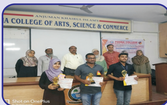
Winners of Quiz competition