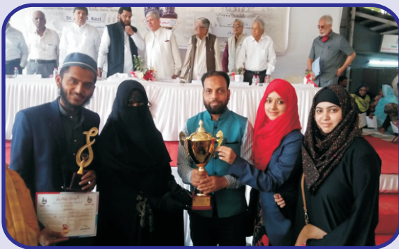
Principal visited to Students demonstrating posters at poster competition

Poona College's participation and winning performance in Qira'at e Quran Competition Organized by Department of Urdu, Arabic & Persian