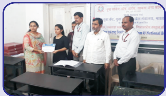
Certificate Distribution in District Level Elocution Competition