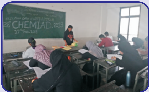
Student participated in "CHEMIAD" Competition

Poona College of Art's Science & Commerce has participated in 28th Chemiad Examination, conducted by Savitribai Phule Pune University. The examination aimed at promoting the vast application & profound influence of Chemistry as a subject in the field of Science. The Examination was conducted on 17th February 2019, in college under the guidance & instructions of the Chemiad officer. All the participants were awarded participation certificate.