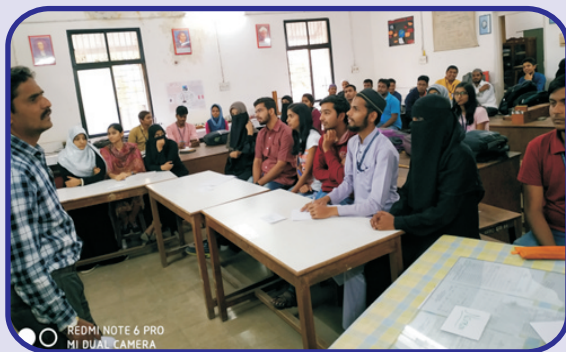
Students in final round of quiz competition

Department of Physics organized Physics Quiz Competition on 25/01/2019 for the students of F.Y., S.Y. and T.Y. B.Sc. Physics.