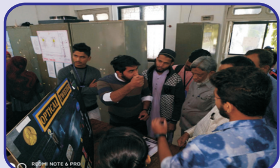
Student is explaining his understanding about the Optical Tweezers