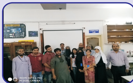
Photo session with winning teams