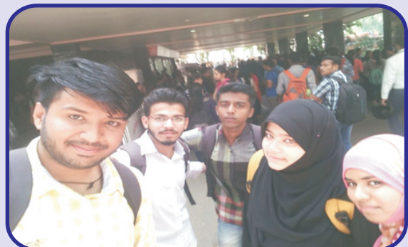
Student participated in "SEED IT IDOL" Competition