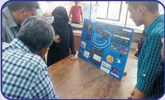
Student is explaining her understanding about Gravitational Waves to the Judges