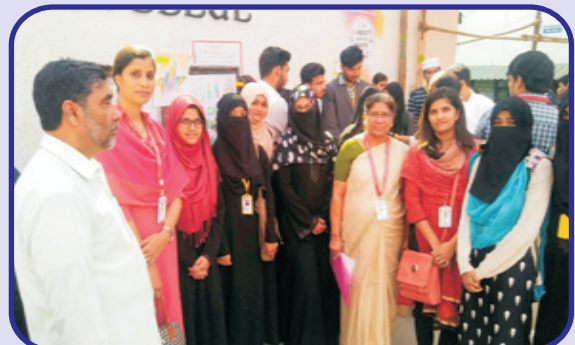
Judges, Faculty-in-charge and Participants in Poster Making Competition (ComFest)