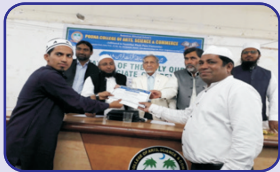
Prize Distribution Function of Qira'at e Quran Competition

All Maharashtra Pyam- e - Rahmat Seeratunnabi Trophy Elocution Competition Organized by Department of Urdu, Arabic & Persian