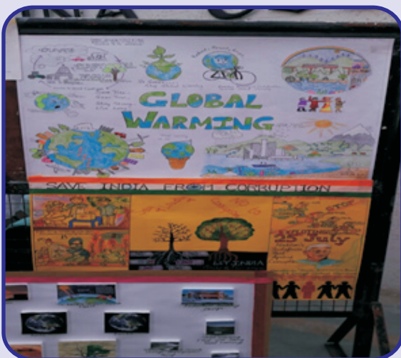
Students Displayed Various Posters in Poster Making Competition (ComFest)