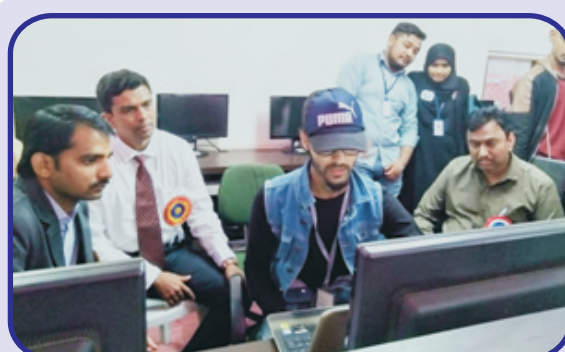
Participants of Software Competition presenting their projects to the judges

The Departmental activity UNISON was held on 22nd January, 2018 at an intercollegiate level. The students from F.Y.B.Sc., S.Y.B.Sc., T.Y.B.Sc., and M.Sc. (Computer Science) participated enthusiastically in all the competitions.