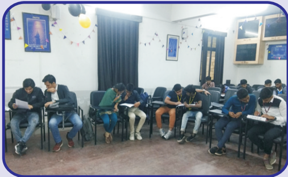
Participants of Cosplay Competition