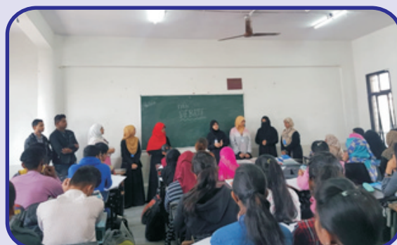
Student expressing their views in Debate Competition