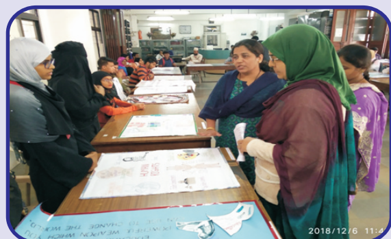
Students demonstrating posters at competition