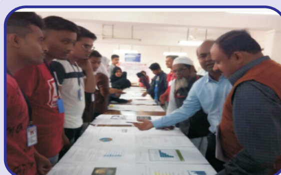
Judges interacting with the participants

Intercollegiate Quiz Competition held on 23rd January 2019 in conference hall. It develops the problem solving skills among the students. Students get motivated towards mathematics. It creates competency and boost up self confidence among the students. Around 45 students from various colleges of Pune were participated.