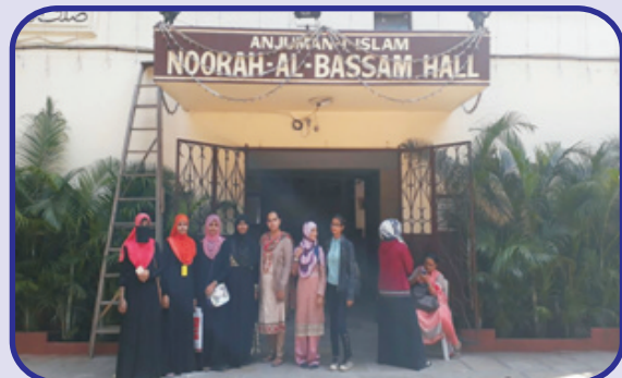
Students along with Co-coordinator at Mehndi Competition, Anjuman Islam Polytechnic.