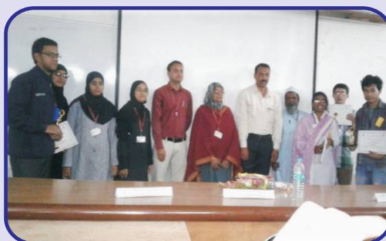
Winners of Quiz, Puzzle and Seminar with staff members