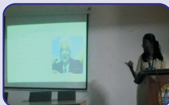
Participant from Abeda Inamdar College, presenting her topic during Story Telling Competition

A Story Telling Competition was organized by Dept. of Chemistry, Poona College on January 28, 2019. This Competition based on success stories of Entrepreneurs. Students from various departments of Poona College participated in this competition and presented the life history of the Entrepreneurs they have selected. They were asked to discuss about the early life, education, ups and downs in their field and the most important is the lesson or take away for us. Participant from UG level discussed the topics very well. The students got motivated to work hard in every aspect of life and they came to know the importance of perseverance after listening the stories of Entrepreneurs & their failures followed by a huge success.