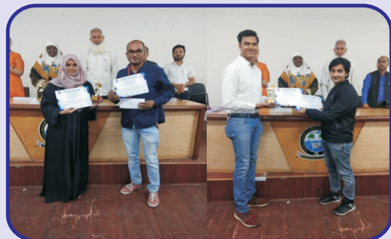
Winners of Quiz Competition

A Presentation Competition was organized by Department of Economics. This competition was designed for the students of Undergraduate students on 04th Sept. 2019. A total of 41 students have attended the competition out of which 30 students has presented. Presentation was mainly focused on poverty, agriculture Status, Age Composition, Economic Policy and their effect etc.