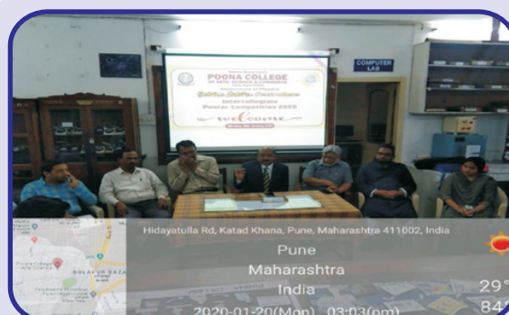
Principal and Vice-principals and other faculty members at the Prize distribution function

Department of Physics organized Physics Quiz Competition on 25/01/2019 for the students of F.Y., S.Y. and T.Y. B.Sc. Physics.