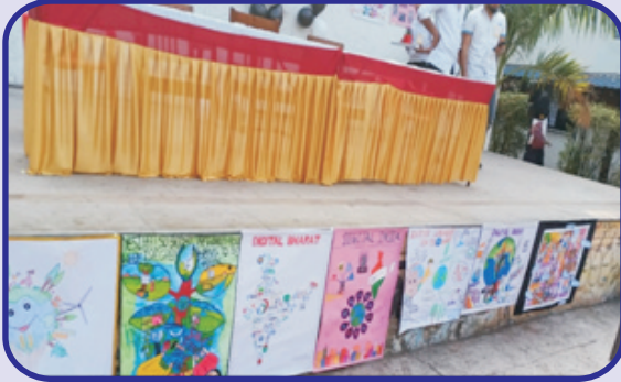
Students Displayed Posters in the Open Auditorium