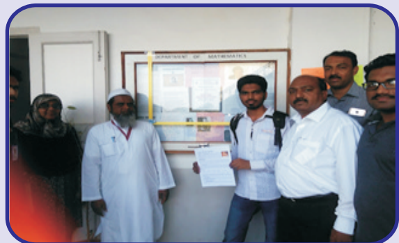
winner participant with Principal, Vice-principal, H.O.D(Mathematics)