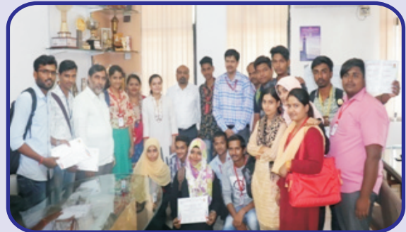
Participants and Certificate Distribution of Srijanlok Kavyapath Pratiyogita