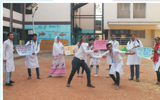
B. Sc. students trying to aware the ill-effects of alcohol consumption, tobacco chewing & smoking through their performance