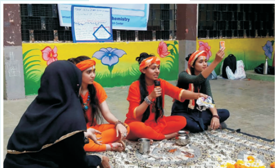
T. Y. BSc students performing the play demonstrating

Reactions like Fire without burn, capture the soul, turning turmeric to sindoor, Fake blood, turning lemon red on cut, ignition through coconut were few important demonstrations explained by our students followed by an informative session on how to fight the wrong belief.