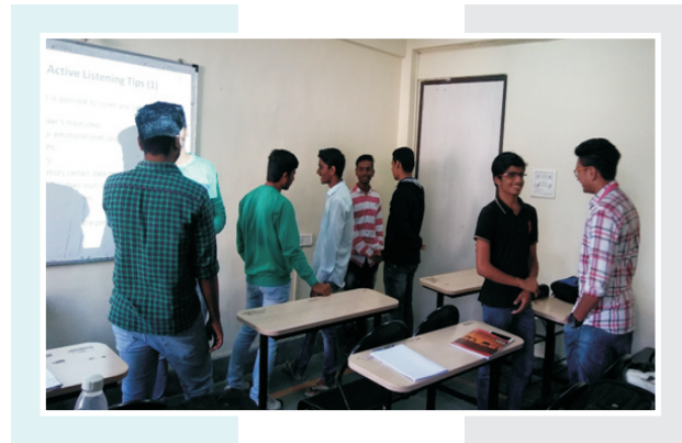
Finally students after learning the essence of Listening