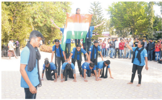
Students performing their play