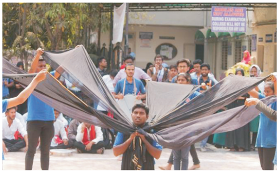
Street Play in motion