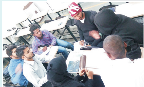
The Creative team in discussion