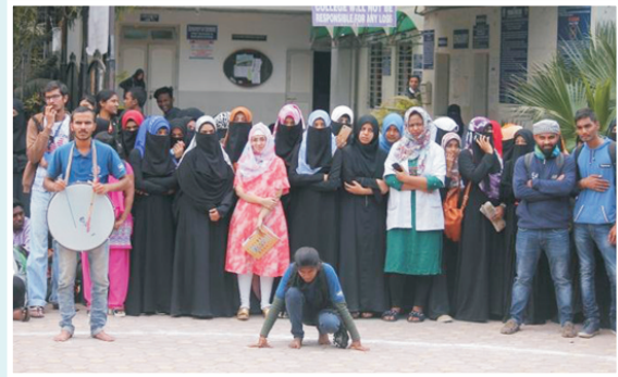
Street Play in motion