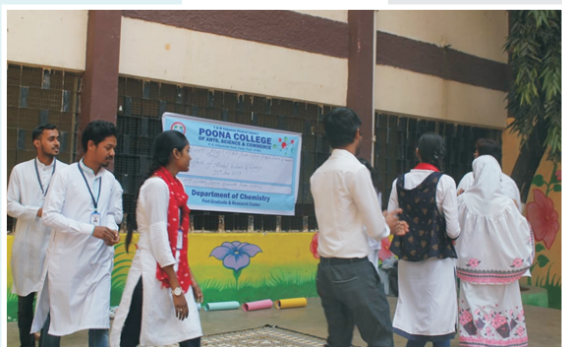
Students concluding the play