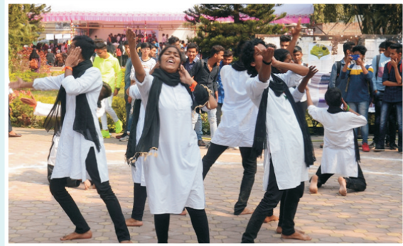
Street Play in motion