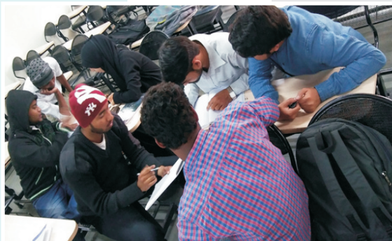
All the departments in sync