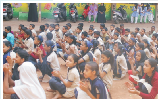
The audience enjoying the play and was drought with emotions