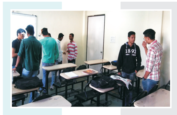
Students changing their groups