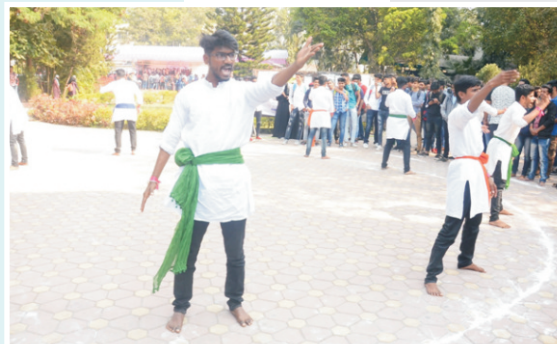
Students performing their play and audience clapping