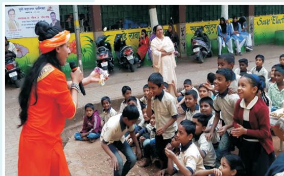
T.Y.BSc students demonstrating experiments to the audience