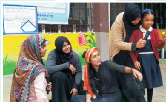
T.Y.BSc students demonstrating various experiments