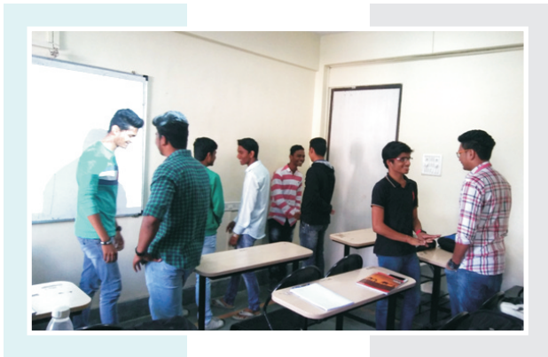
Students confused after the disturbance created