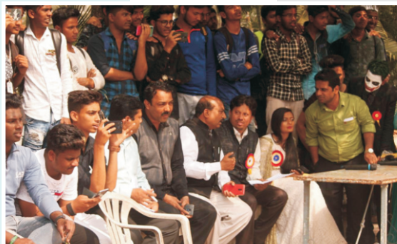
Street Play in motion and the authority with the judges