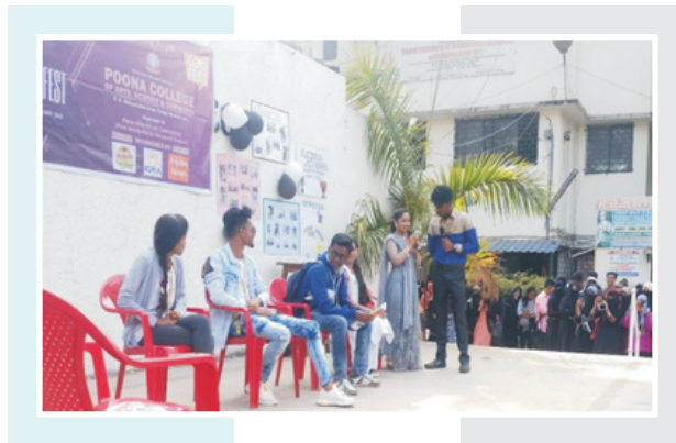
Team number one students performing at the competition