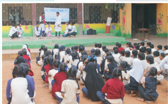
Students of S.Y.BSc. performing street play

The students of S.Y.BSc. looked much disciplined towards their art and their performance succeeded in sending their message across powerfully as every face in the audience was drought with emotions.