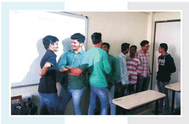
Students formed their groups

Listening is the most fundamental component of interpersonal communication skills. It was a grand successful activity as to students could learn the objective of this activity.