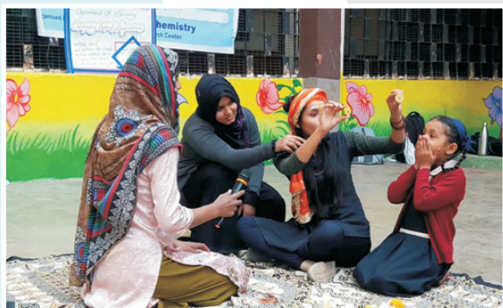
Students of T.Y.B.Sc. Chemistry Engrossed in performing reaction to show various false beliefs under the topic chemistry behind superstition