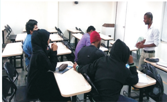
One of the students in Client Servicing role

Account planning is a relatively more recent function. The role here is to essentially think on behalf of the client, and to prepare the agency itself for pitching to a new client. The skills called for include knowledge of market research techniques and consumer behaviour. Students got to learn all these varied functions of an ad agency.