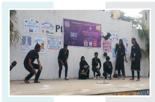
Team number two students performing at the competition