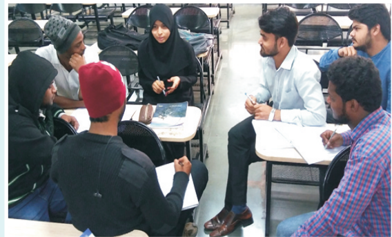
The Media Planning Team in discussion