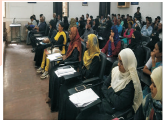
Teachers and Parents with Students