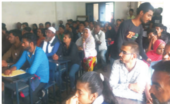
Parents and teachers at the Meet

She also highlighted the best practices followed by Poona College of Arts, Science and commerce like personal Guidance and Concurrent evaluation of the students, Guest Lecture, Industrial visit, Innovative Idea, Social activities and Study based Activities for effective teaching learning process and how it helps students in placement and for higher studies.