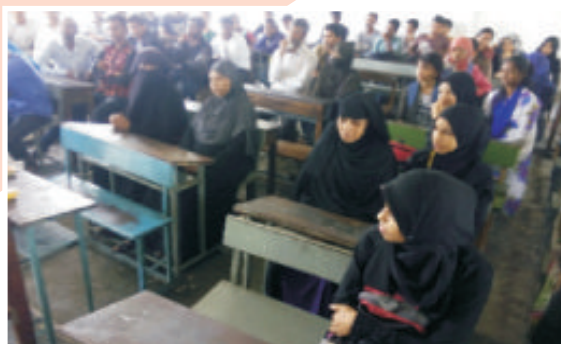
Students attending the Meeting with their Parents