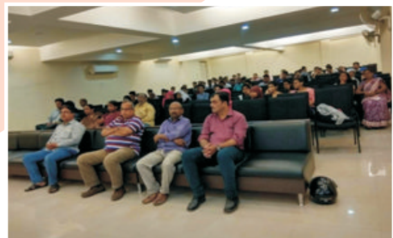
Parents and Students attending meet