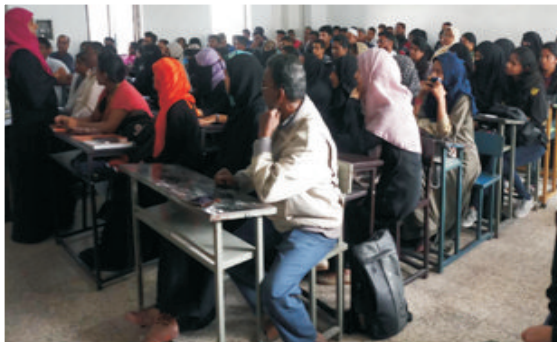
Parents attending the meet in Hall no 33

Parents responded well as they came up with many questions and got their queries solved