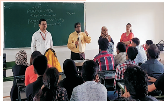
Parents and teachers at the Meet