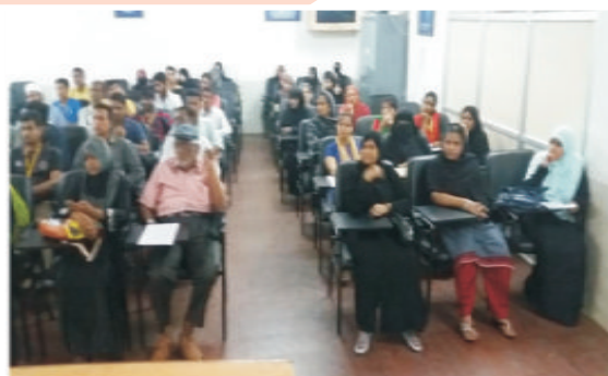
Parents at the meet