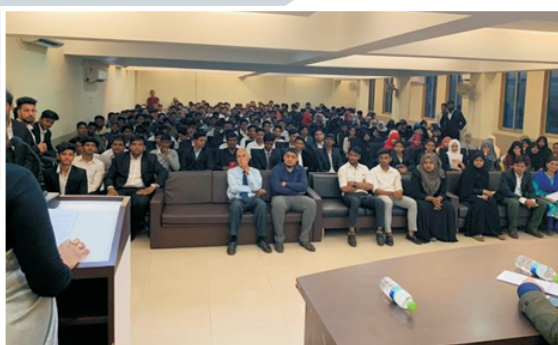
The mesmerized audience