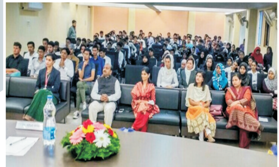
The mesmerized audience