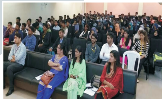
The mesmerized audience