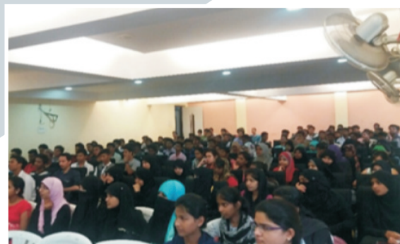
FYB.Com Students during Orientation programme