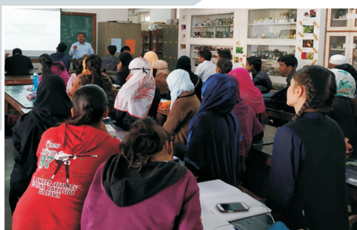
Participants listening attentively during Orientation Programme