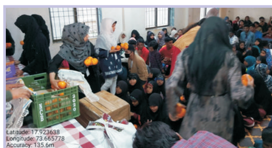
Students distributing fruits and sweets amongst students of the orphanage