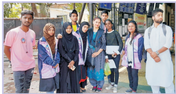
Muskaan Volunteers preparing for the visit to SOFOSH Shreevasta

On 14 February 2020, the teachers and student volunteers of Muskaan: The Healing Smile, the Social initiative of Poona College showed the world a new way of celebrating Valentine's day. On this day, they visited SOFOSH Shreevatsa, the adoption Centre of Sassoon Hospital and shared the happiness and love with the little angels of the centre. These young students were surprised to see how one can be so inhuman as to desert the new born innocent babies. Muskaan volunteers also gifted these children some essential food items, essential medicines like wikoryl, zifi, doulinrespules, Dettol, bathing soaps, vegetables, sago, biscuits etc. Shreevasta is really nurturing and rehabilitating the children from deprived family. It is definitely providing loving shelter to the abandoned and challenged children. At this centre one could say that truly empathy meets medical care...Poona College salutes SOFOSH (Society of Friends of the Sassoon Hospital) Shreevasta for the noble cause.