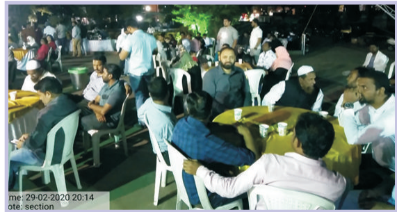
provided a good opportunity for the teaching staff to mingle with the families of non-teaching and menial staff

“There is no exercise better for the heart then reaching down and lifting people up.”