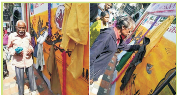
The poor and needy people picking up clothes from the wall of kindness