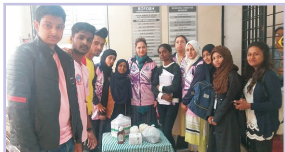
Students and Teachers of Poona College at SOFOSH Shreevasta