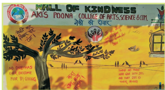
Wall painted by Muskaan: The Healing Smile Volunteers on M.G. Road