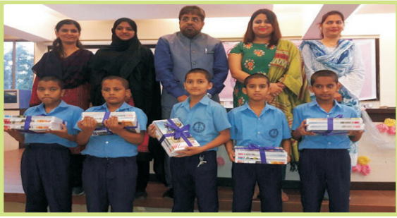
Faculties with the children of Tayyabiya Orphanage