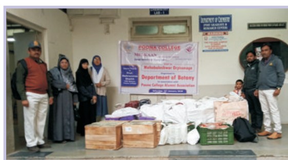
Staff, Department of Botany with donations for orphanage in kind.