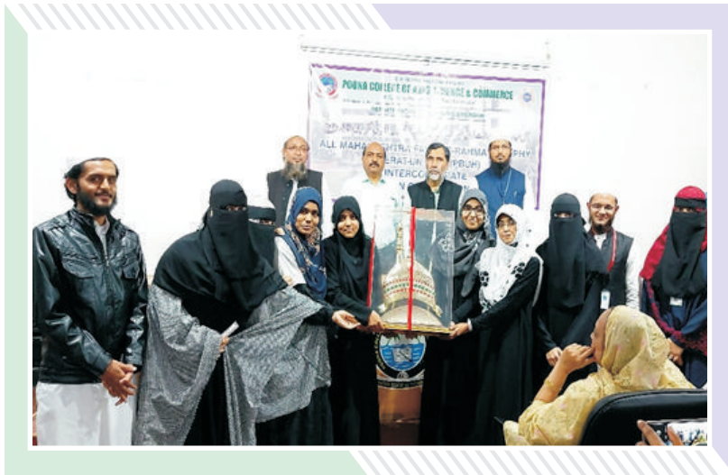
Poona College wining team with the PYAM E RAHMAT TROPHY.