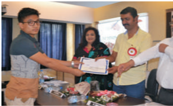
Students attending the Meeting with their Parents