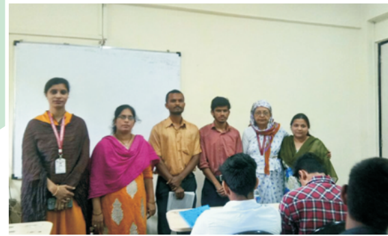
BBA faculties with Guest Speakers