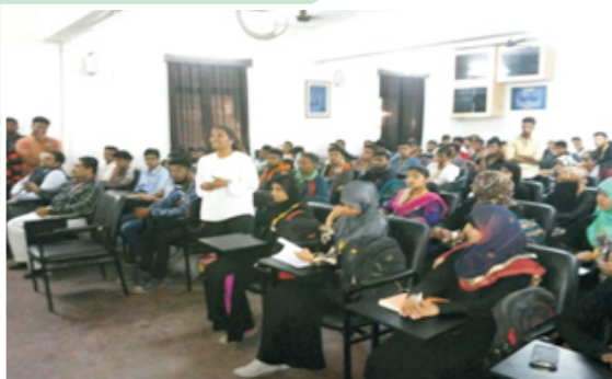
Student is interacting with the speaker during the question answer session