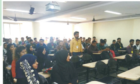
students are interacting with the speaker during the session.