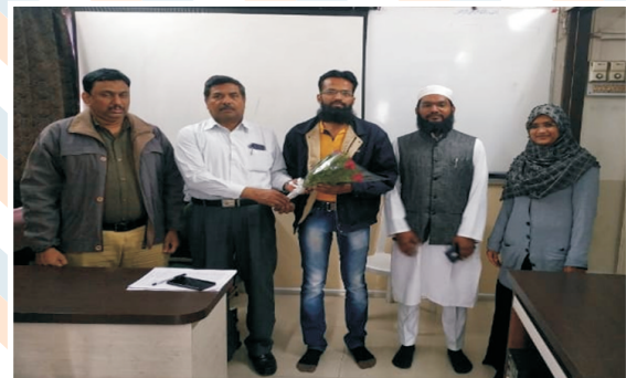
Guest with the staff members of Department of Computer Science