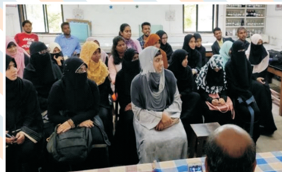
Alumni during the program