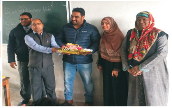
Workshop on Economies of India and UAE- A comparative Study