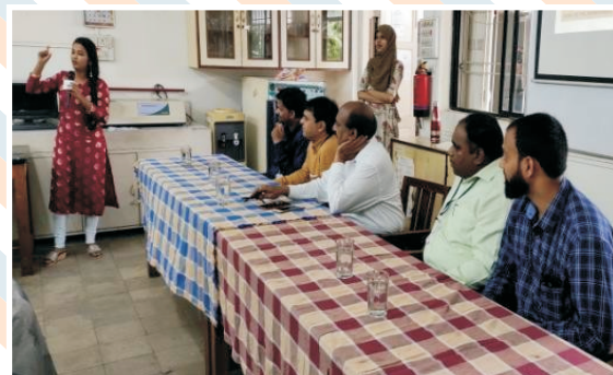
Alumni sharing their experience and views during the program