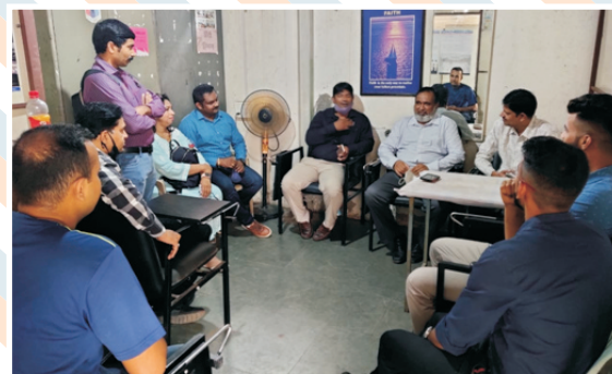
NCC Alumni in NCC office with Past and Present NCC Officers of our College