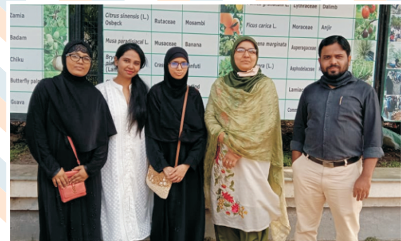
Group photo of staff with Alumni near the Horticulture Garden