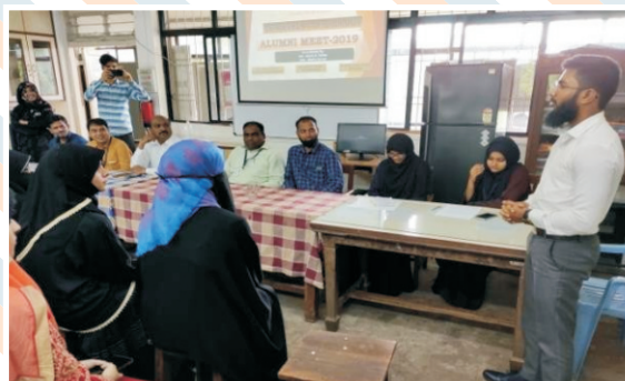
Alumni sharing their experience and views during the program