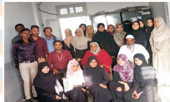
Alumni with H.O.D and teaching staff