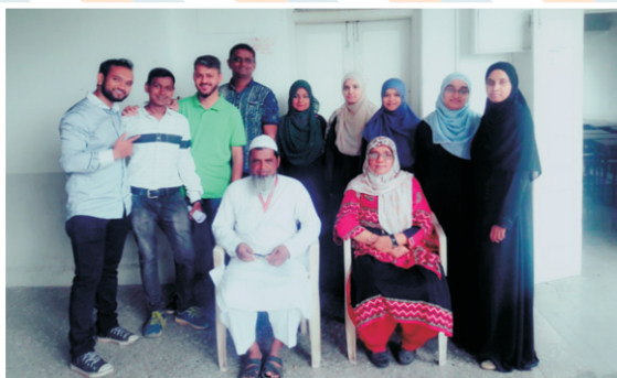
Alumni attended "ALUM 2018-19"