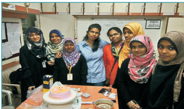
The first eggless cake made by the students during the Cake Making Activity