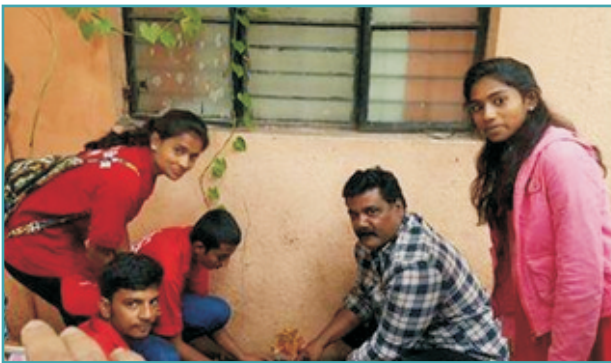
Tree Plantation Drive run in Swargat Police Station