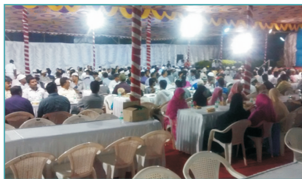
Audience for the Iftar Party waiting for Roza Iftar in Penndel Ramzan Iftar Party, Poona College Ground