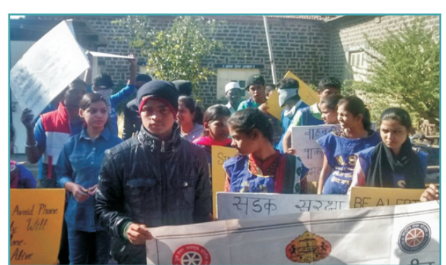
NSS Girls Volunteers also took part in the road safety rally around Poona College