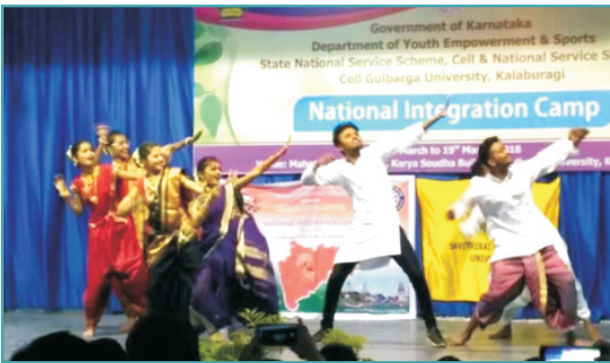
NSS volunteers performing cultural program during National Integration Camp held in Karnataka