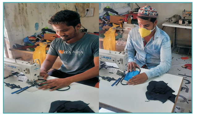
Students stitching masks to be donated to the health workers, needy during the pandemic