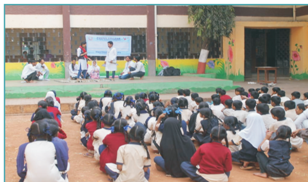
Students of S.Y.BSc. performing the street play at Sapika High School