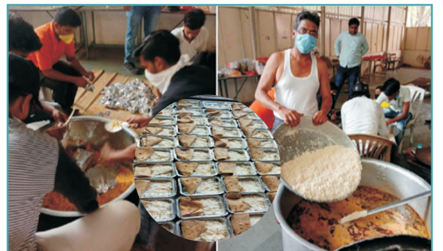
Preparation of Food Packets