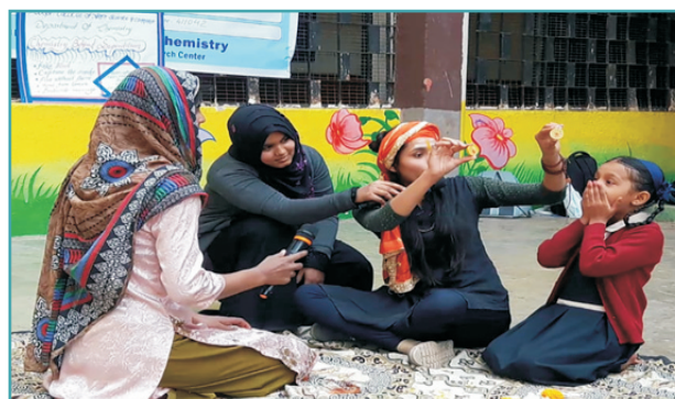
Chemistry behind Superstitions Act performed by B.Sc. Students