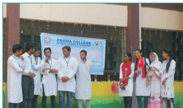
Students participated in street play at Sapika High School