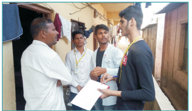
Nss Volunteers Interacting With The Villagers During Survey