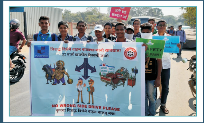
Students of Pooa College during Road Safety rally