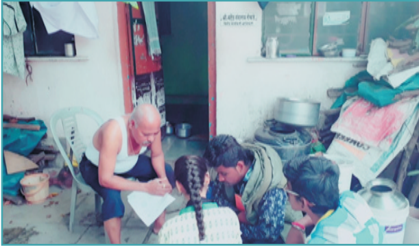
Poona College NSS volunteers surveying the villages by visiting every house & counselling them to give up subsidy