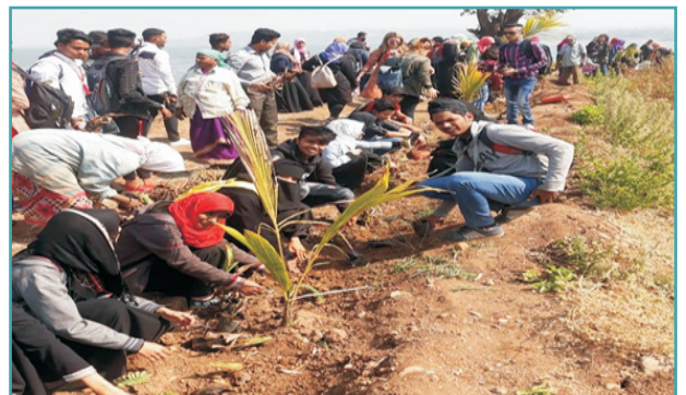
Tree plantation on both sides of the road in Bogaon