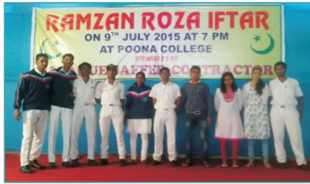
Poona College NCC Cadets worked as volunteers in the event Ramzan Iftar Party, Poona College Ground

The Independence fighting lessons of Patel and India's "Unity for Diversity" were discussed on this day along with India's many religions, civilizations, traditions and languages.