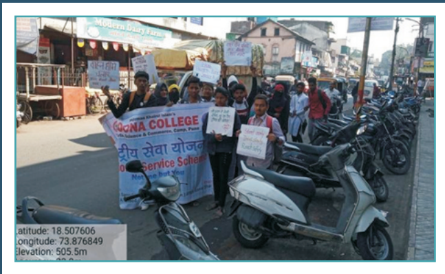
Students in Walkathon with placards on Road Safety