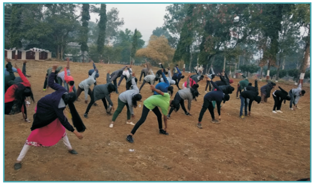
Yoga Session NSS special winter Camp