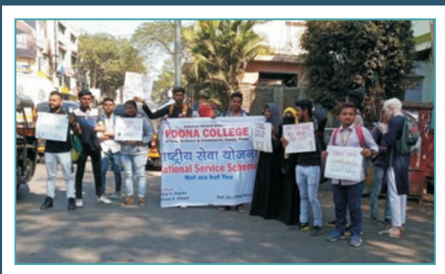
Students in Walkathon with placards on Road Safety