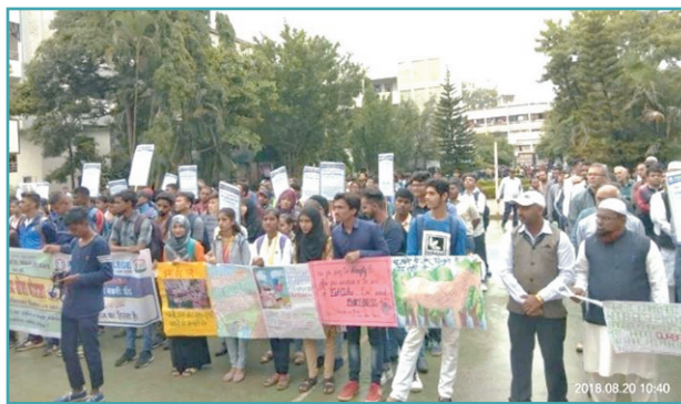
Poona College Teaching and Non-teaching staff, students and NSS volunteers during rally on SaafSuthri Bakr Eid