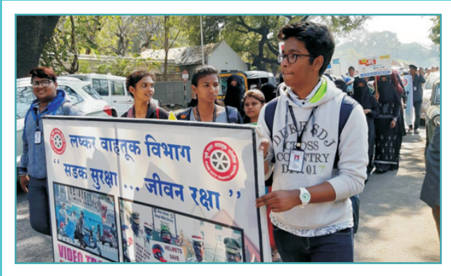
Students of Pooa College during Road Safety rally