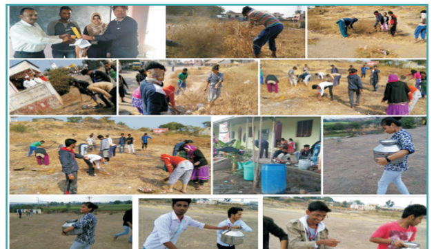
Seven Day Camp at Bopgaon