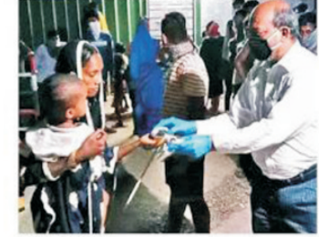
Meals prepared daily; students, faculty members and alumni chip in with help

By Archana More, Pune Mirror / Apr 13, 2020, 06:00 AM IST