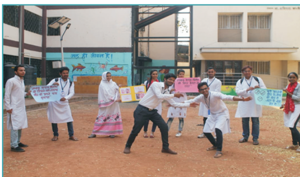
Students of S.Y.BSc. performing the street play at Sapika High School