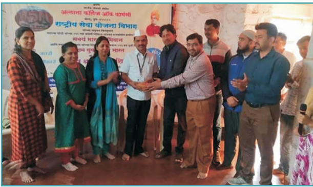
On arrival was felicitated the police Patil of kanhe village NSS special winter camp