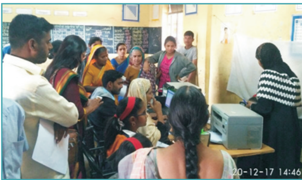
Voter ID Registration Drive