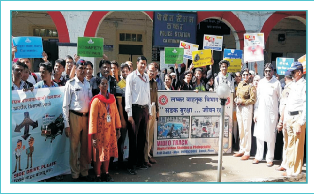
Students and Staff of Pooa College along with Traffic Police Personnel during Road Safety rally