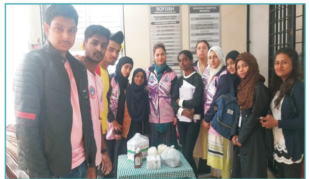
Students and Teachers of Poona College at SOFOSH Society of Friends of Sassoon Hospital