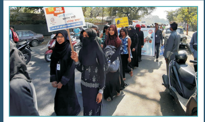
Students of Pooa College during Road Safety rally