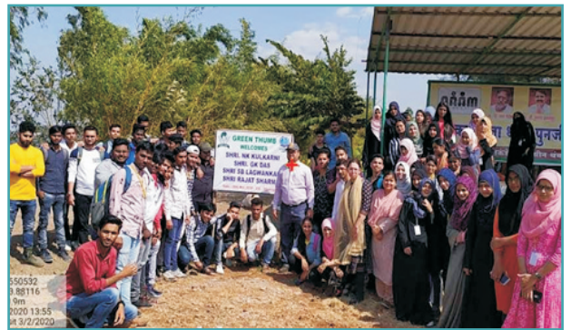
Students along with teachers at the Khadakwasla Dam