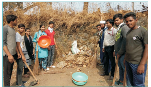
Poona College NSS volunteers cleaning up the surrounding