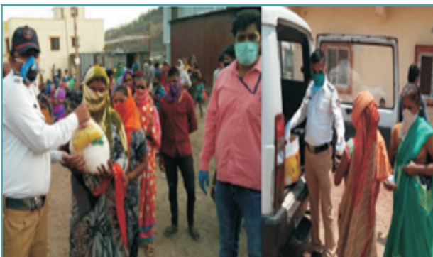
Distribution of Grocery Kits in various areas of city