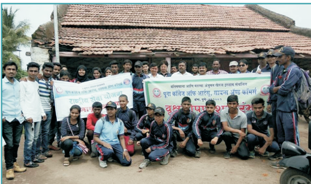
The Poona College Team to Bopgaon for Tree Plantation