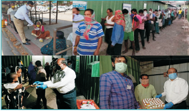
Distribution of Food Packets at Labor camp and to Needy People