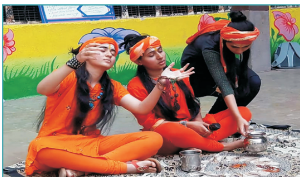
Chemistry behind Superstitions Act performed by B.Sc. Students