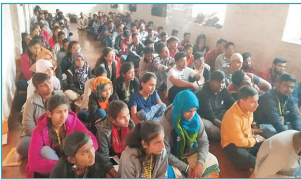
Campers Listening To The Speaker Conscientiously NSS special winter Camp