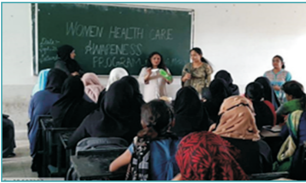
Women's Health Awareness Program