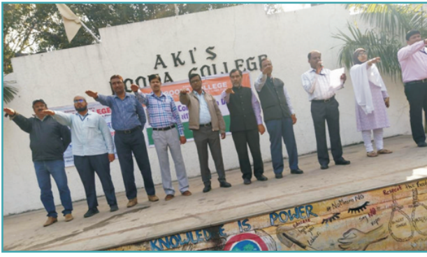
Reading the Preamble of the Constitution of India.