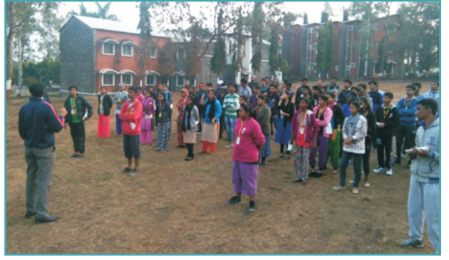
Yoga Sessions at dawn during seven-day stay at Kanhe