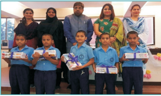
Orphanage while receiving stationary kits