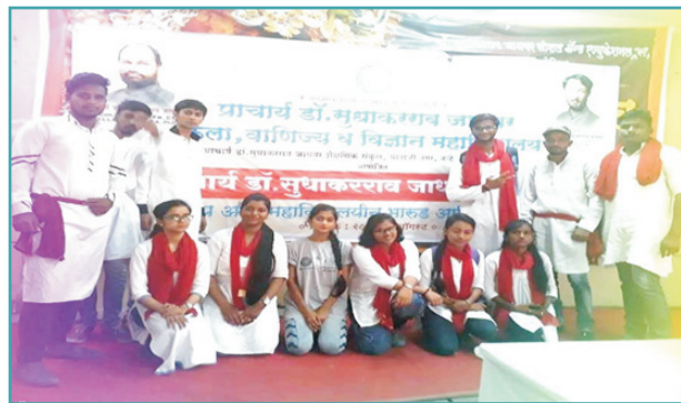
Poona College 'performers' of the street play

Important reactions including fire without burn, capture the soul, turmeric to sindoor, fake blood, and ignite through coconut etc. were performed.