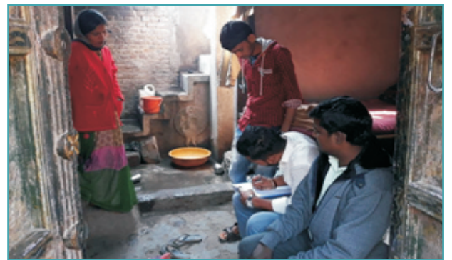
Poona College NSS volunteers surveying the villages by visiting every house & counselling them to give up subsidy