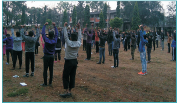
Yoga Sessions at dawn during seven-day stay at Kanhe