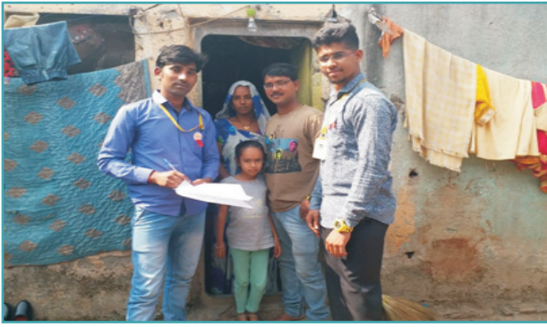
Poona College NSS volunteers surveying the villages by visiting every house & counselling them to give up subsidy