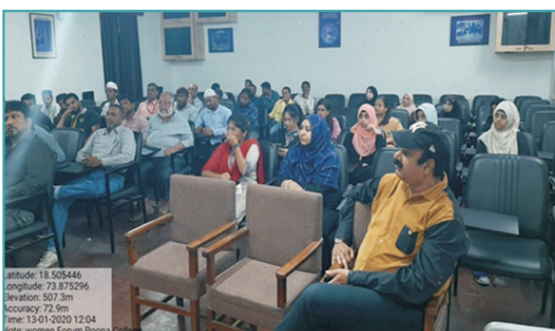
Audience at the Workshop