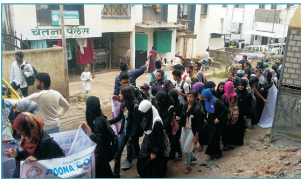
Concern for all - Poona College NSS Volunteers sloganeering during the rally on SaafSutri Bakr Eid-an appeal to maintain cleanliness during Eid