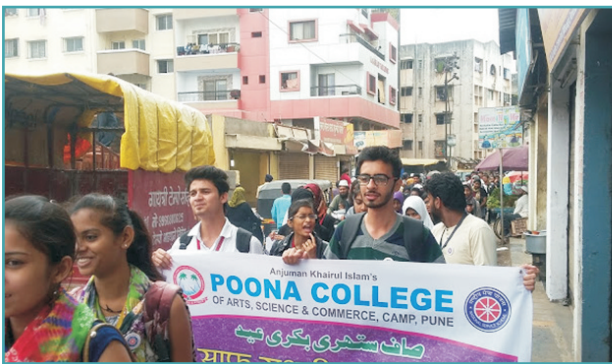
Concern for all - Poona College NSS Volunteers sloganeering during the rally on SaafSutri Bakr Eid-an appeal to maintain cleanliness during Eid