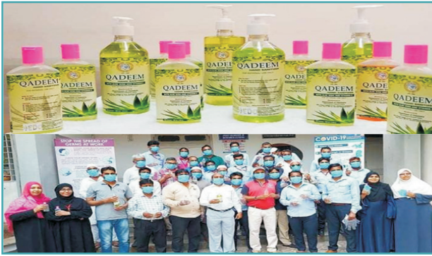
Department of Chemistry made hand sanitizer and distributed to the staff members at no profit basis