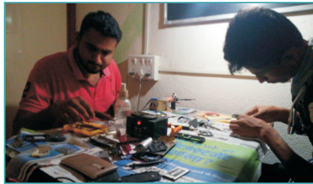
Students practicing in the Component level workshop of Mobile Repairing

Soap and washing powder production are among others.