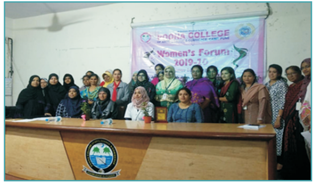
Staff and Guests at the Guidance Talk