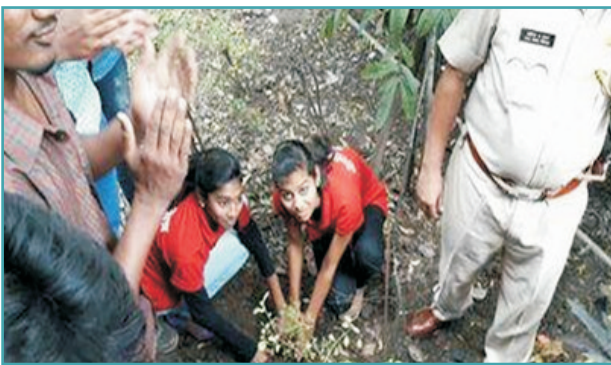
The NSS volunteers and the police personnel planting trees in a Police Station