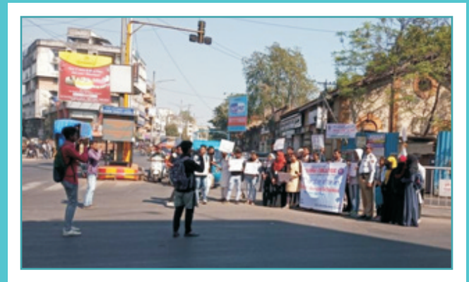
Volunteers with traffic police at East Street, Camp, Pune during Walkathon