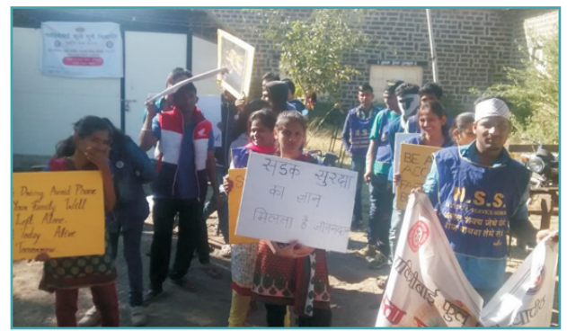
NSS Volunteers during road safety rally around Poona College on with posters and banners

They carry banners, placards like 'slow and safe driving,' 'no use of cell phones while driving,' etc.