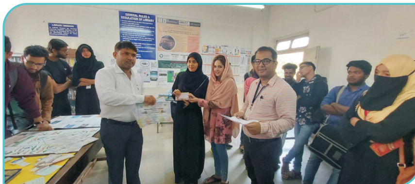
Certificates being distributed to the winners of the competition on 8/1/2020

A Poster Competition on “National Identities and Symbols of India” was organized on 8th January 2020 in the college library. The aim was to test the ability and creativity of the students and to explore their potential. National Symbols are a source of pride for any country and it is imperative that the rising young generation of the country should be acquainted with them. Students from all streams participated and the winners were felicitated with cash prize and certificates.