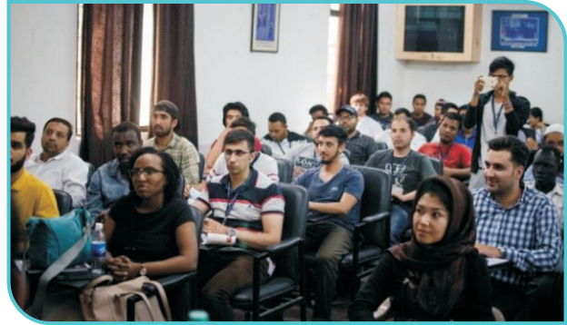
120 registrations were witnessed inclusive of students and teachers from 10 different colleges and 45 international students participated representing 12 nations (09/03/2018)