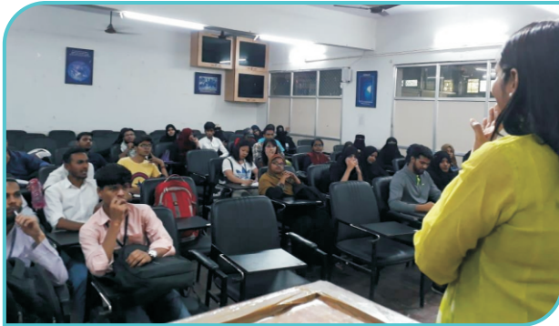
Voter awareness workshop of NSS, NCC, Earn and Learn students on 12/4/2019 at 4:00'o clock

A Voter awareness workshop for the teachers and students was organized between 12/4/2019 to 16/4/2019 in which they were made to realize and value the sincere efforts of all government and non-government organization (like Systematic Voter Education and Electoral Participation program) in making the election process easy, convenient so as to increase the percentage of voters. Voter's pledge was taken at the end of each session.