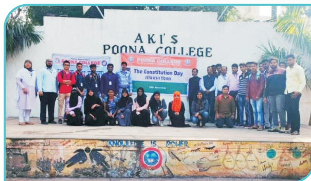
Celebration of Constitution Day 26/11/2019