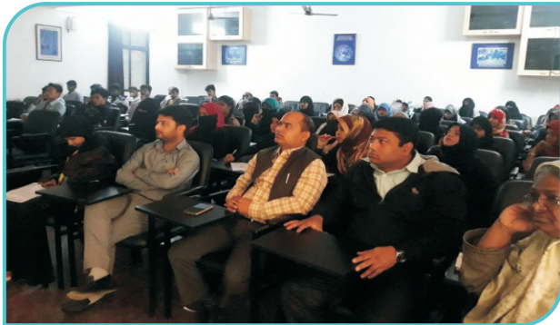
Students and Faculties watching the Documentary on Indian Constitution, 8th February 2019

A documentary on Indian Constitution – Samvidhan was screened on 8th February 2019. Samvidhan: The Making of the Constitution of India is a ten-part television mini-series based on the making of the Indian Constitution , directed by Shyam Benegal . This documentary helped the students to understand and acquire information about how the constitution of India was framed and how constituent assembly debated on each and every article that was include in Indian Constitution.