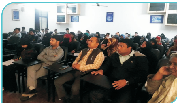
Students and Faculties watching the Documentary on Indian Constitution, 8th February 2019

A documentary on Indian Constitution – Samvidhan was screened on 8th February 2019. Samvidhan: The Making of the Constitution of India is a ten-part television mini-series based on the making of the Indian Constitution , directed by Shyam Benegal . This documentary helped the students to understand and acquire information about how the constitution of India was framed and how constituent assembly debated on each and every article that was include in Indian Constitution.