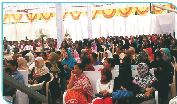
Teaching Staff and students present in the open-air auditorium (07/02/2018)