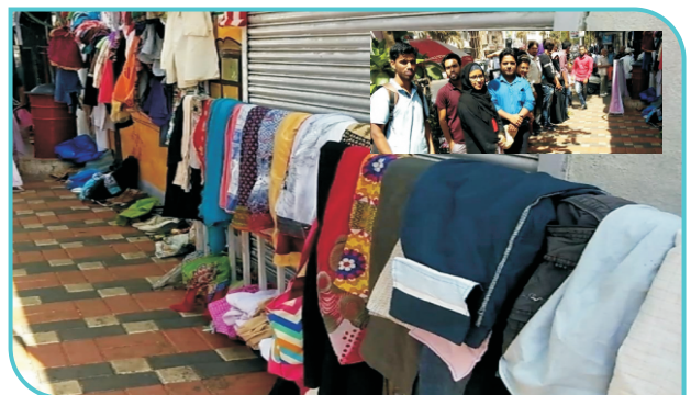
The donation items & The donors (05/01/2019).