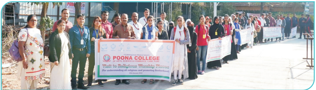
Students and Staff participation in Visit to Religious Worship places on 25th Jan. 2019