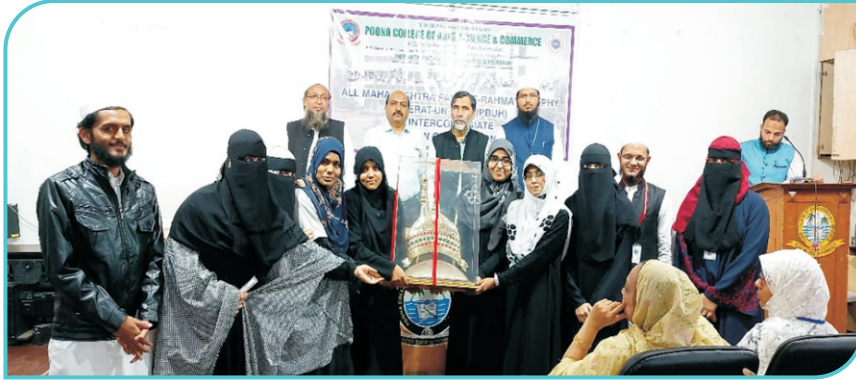
Winning team with the PYAM E RAHMAT TROPHY

All Maharashtra Payam-e-Rahmat Trophy Seerat-un-nabi State level Intercollegiate Elocution Competition was organized on 11th January 2020. The competition was organized in Urdu and English. Students from various colleges of Maharashtra Participated .The objective of this competition was to enable the students to fight their fear of public speaking whilst getting an in-depth understanding of the life of Prophet Mohammad.