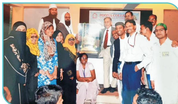
The winning team with trophy held on 09/01/2016