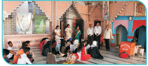
Students and Staff participation in Visit to Mandir on 25th Jan. 2019.