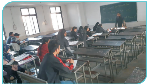
Students are listening the lecture in the Guidance Talk entitled "Free and Fair Elections and Democracy" 31th January, 2020