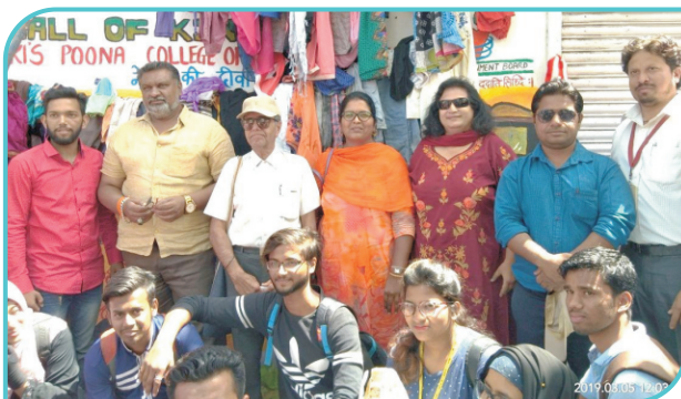
Members (staff and students) of the Department of English with spectators bowled over by the altruistic act of the Department (05/01/2019).

A Mega Donation Drive was organized at the heart of Pune City with an aim to provide clothes, blankets, bed-sheets and other useful things to the scores of needy people who spend their life on footpaths of MG Road and the slum-area surrounding it. Students Collected and donated 60kg clothes at the Wall of Kindness, a wall of Pune Cantonment Court painted by the philanthropic wing of Poona College Muskaan: The Healing Smile.