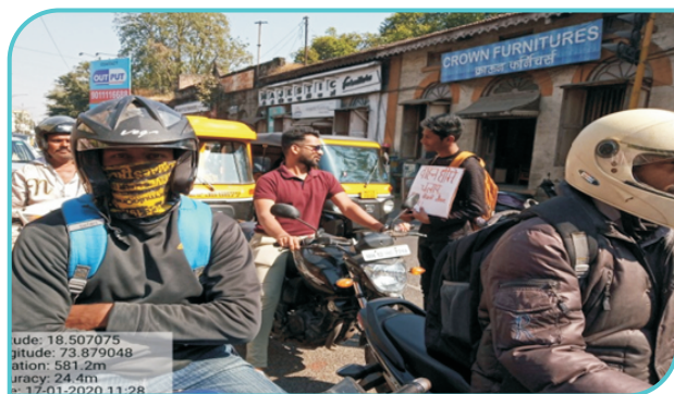
Students explaining the 'importance of use of helmet'

11th to 17th January, 2020 was observed as the 31st National Road Safety Week 2020 this year in India to sensitize public on road safety measures. Various activities pertaining to road safety were organized on 17th January, 2020 by our college. Volunteers of Poona College, moved to areas of heavy traffic, interacted with people at squares, explaining to them the risk to life when driving without a helmet. They carried placards that spread the message of 'slow and safe driving', 'avoiding use of mobile while on the wheel', etc.