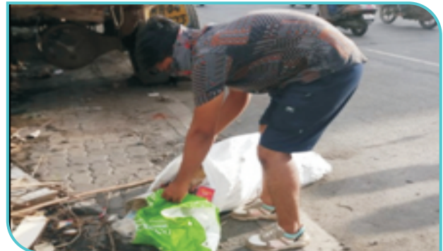
Cleanliness Drive by NSS student volunteers