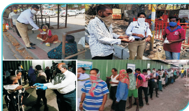
Distribution of Food Packets at Labor camp and to Needy People