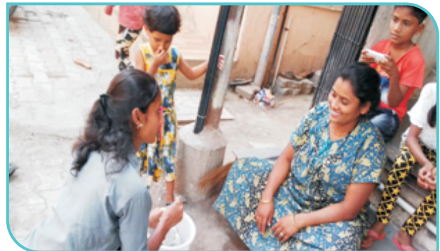
NSS volunteers during Survey of School Dropouts in Harkanagar, Chudaman Talim and Bhavani Peth