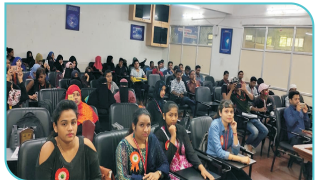
हिंदी पखवाडे के अवसर पर उपस्थित विजेता प्रतिभागी छात्र