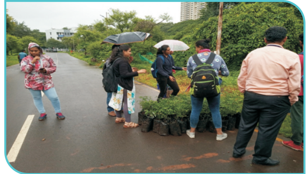
Students planting the various plants at SPPU area