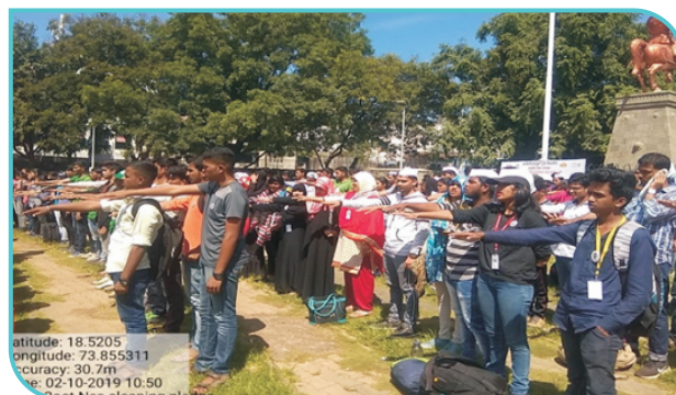
Pledge for Cleanliness and Plastic Free Pune at Shaniwarwada, Pune