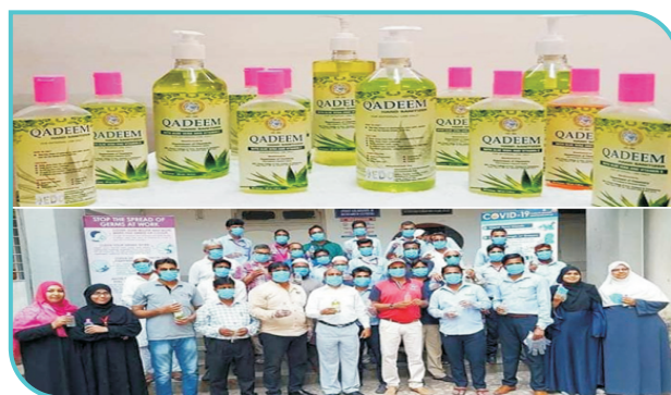
Department of Chemistry made hand sanitizer and distributed to the staff members at no profit basis