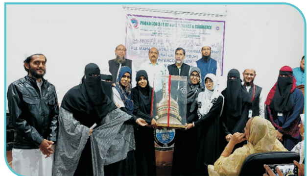
Winners of All Maharashtra Seeratunnabi (Payam-e-Rahamat Trophy) competition