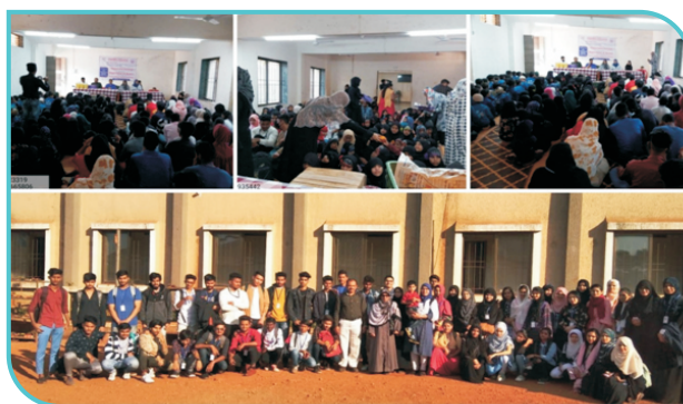
Visit and Donation of Goods at Mahabaleshwar Orphanage