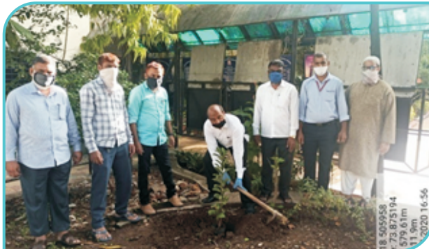
Principal & Staff planting fruit trees in College garden