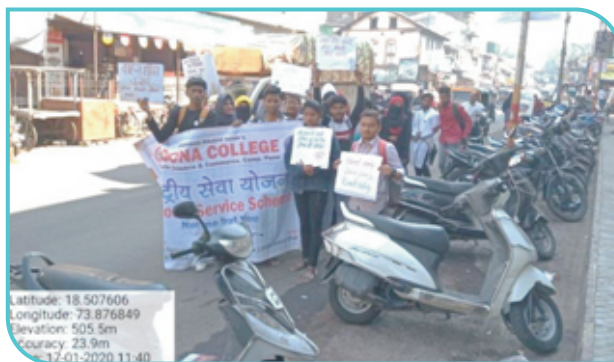
Students in Walkathon with placards on Road Safety