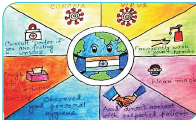
Posters made by NSS volunteers on Awareness of COVID