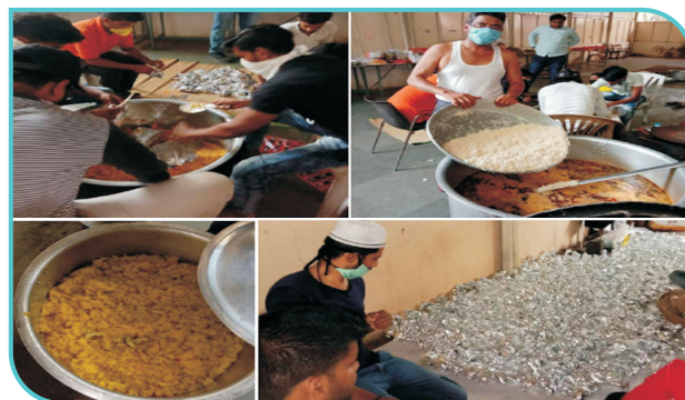
Preparation Food Packets