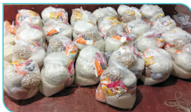
Grocery Kit Prepared for Distribution