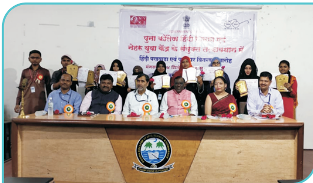
हिंदी पखवाडे के अवसर पर उपस्थित विजेता प्रतिभागी छात्र

दि. १३ सितम्बर से २४ सितम्बर तक पूना कॉलेज हिंदी विभाग एवं नेहरू युवा केंद्र व संयुक्त तत्वाधान में हिंदी पखवाडे में हिंदी पखवाडे के अंतर्गत विविध स्पर्धाएँ संपन्न हुईं। दि. २४ सितम्बर को शुद्ध हिंदी लेखन प्रतियोगिता के अंतर्गत विषय इस प्रकार थे - हिंदी भाषा, डिजिटल इंडिया, राष्ट्रभक्ति एवं राष्ट्र निर्माण, बेटी बचाओ, बेटी पढाओ, इंटरनेट - लाभ, हानि तथा स्वच्छ भारत - स्वस्थ भारता। दि. २४ सितम्बर को कॉन्फ्रेंस हॉल में पुरस्कार वितरण समारोह संपन्न हुआ।