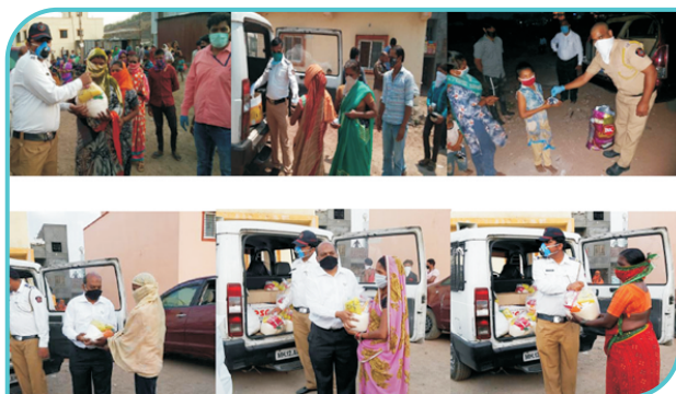
Distribution of Grocery Kits in various areas of city