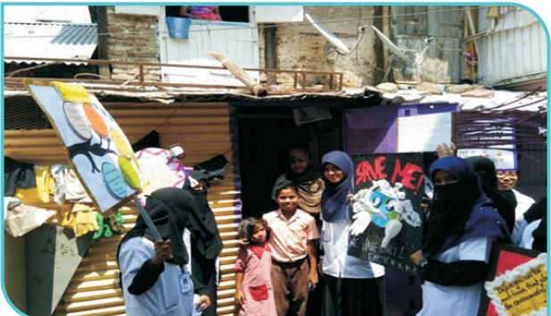
Students aware ring people about cleanliness at neighboring area of college