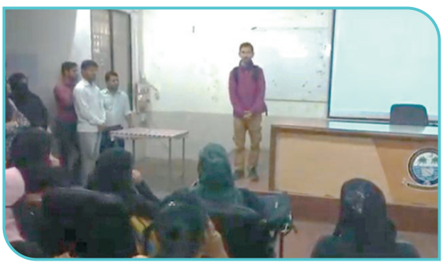
An attendant sharing his review on the cinematic rendering of the story with the audience