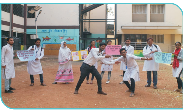
Students Performing Street Play about ill effects of alcohol, tobacco & drugs