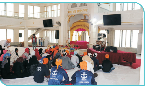
Students and Staff participation in Visit to Gurudwara