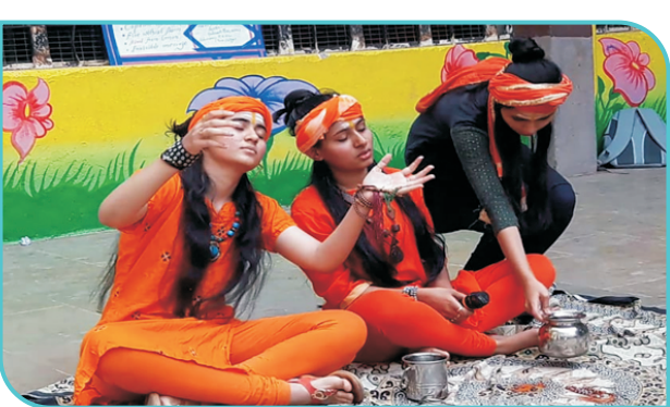
Students performing play to aware students