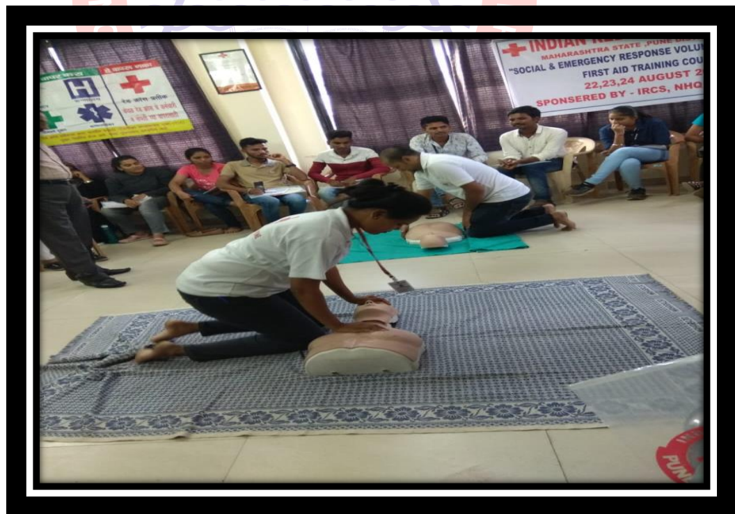
Participant students taking training of CPR @ Red Cross First Aid Training Camp (23/08/2019)