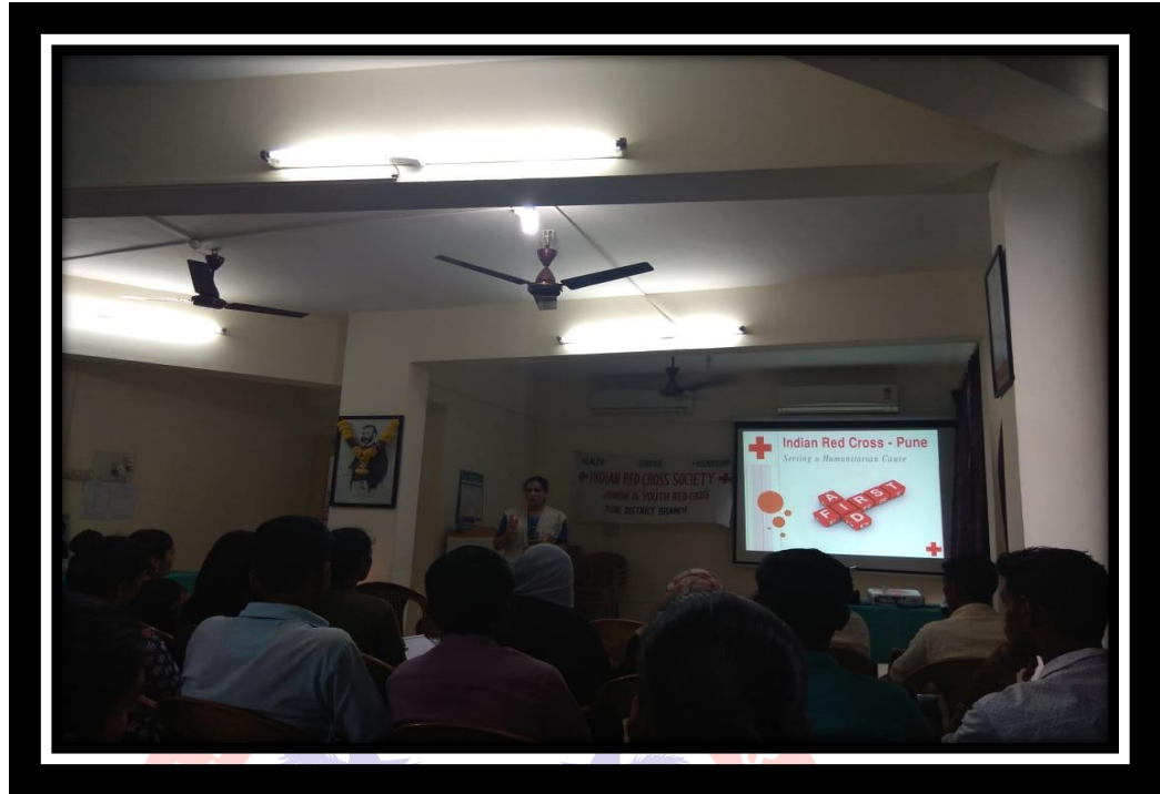
Participant students at Red Cross First Aid Training Session (22/08/2019)