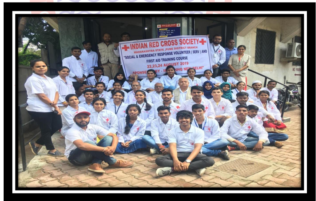
Participant students at Red Cross First Aid Training Session (24/08/2019)