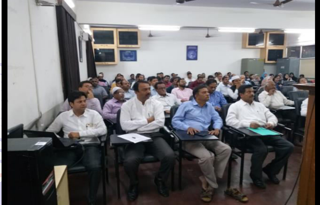
All Senior College Teaching staff observing presentations